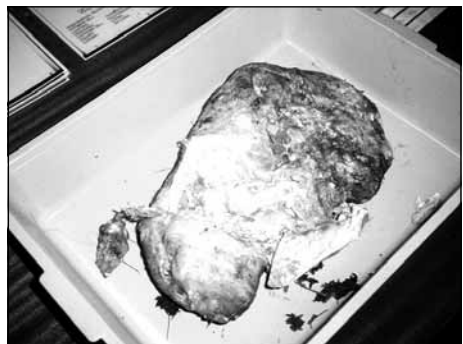
Fig. 3 Piglet, excavated after having been in the bog for six months. ■

One of the results of excavation between 6 to 36 months later was that the