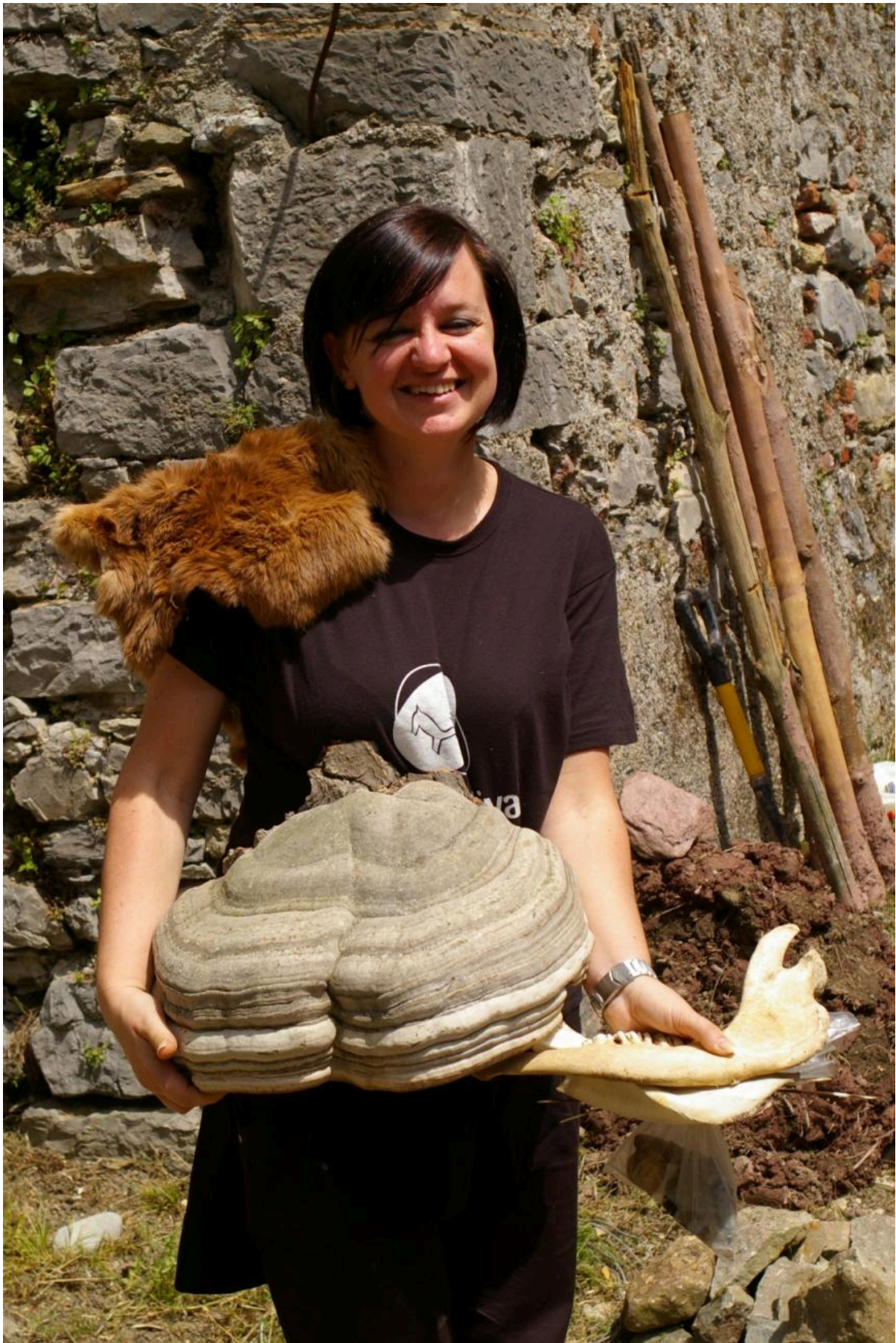
FIG 20. FOMES FOMENTARIUS FROM THE MARKET