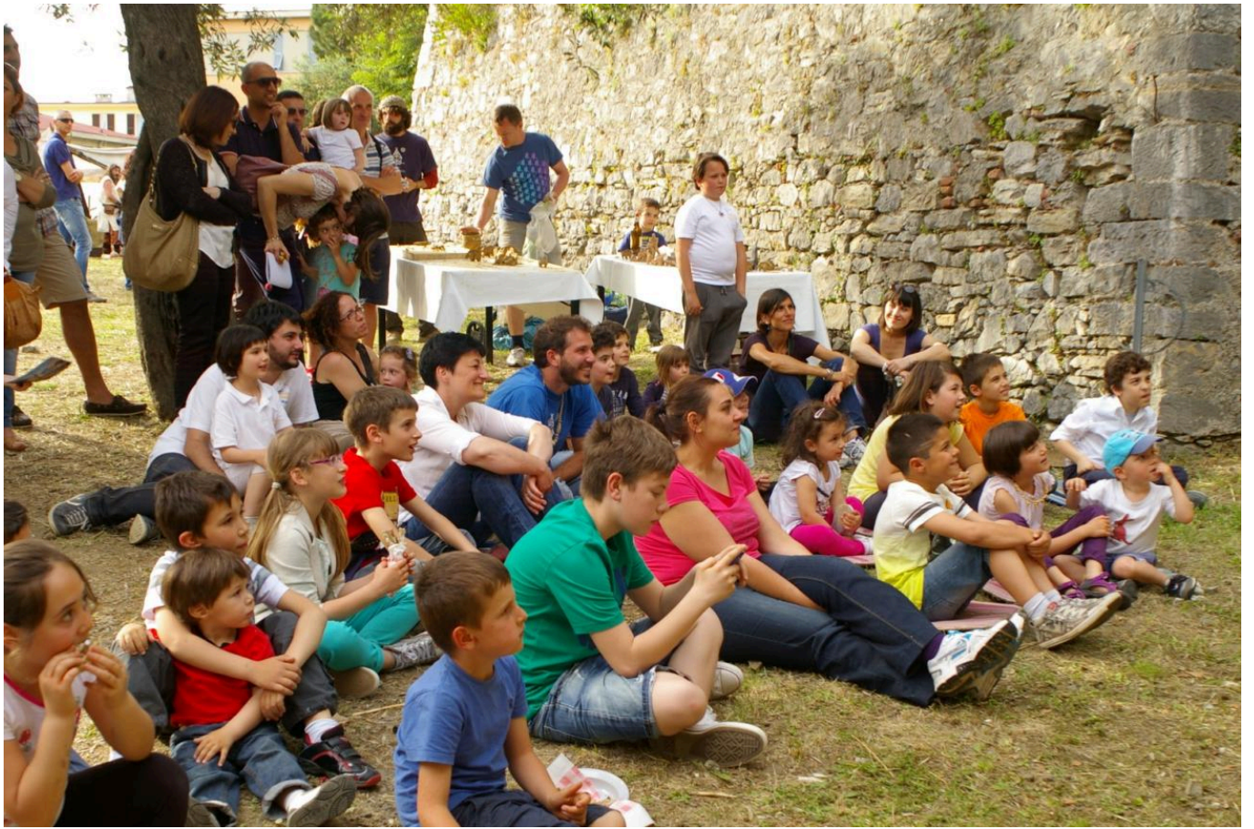
FIG 13. CHILDREN LISTENING TO A TALK