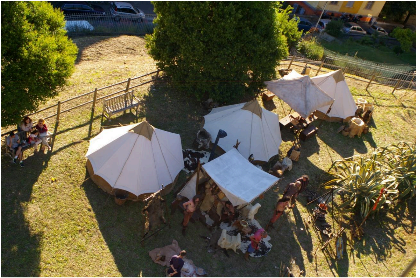
FIG 5. VIEW OF THE CELTIC CAMP