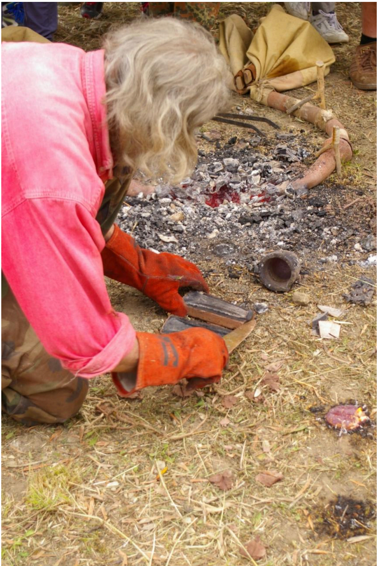
FIG 11. EXTRACTING A BRONZE AXE FROM MOLD