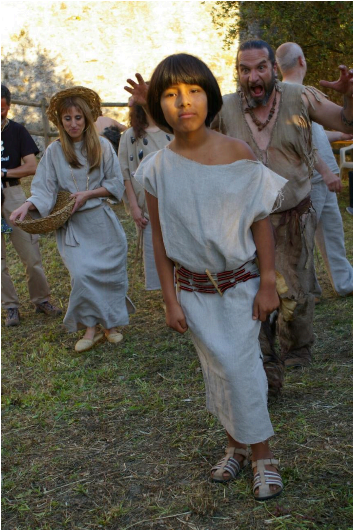
FIG 6. THE PARADE