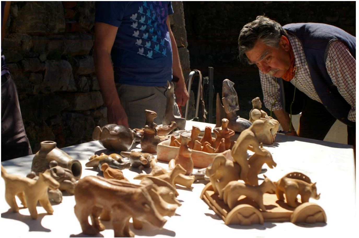
FIG 7. CLAY ANIMAL WORKSHOP