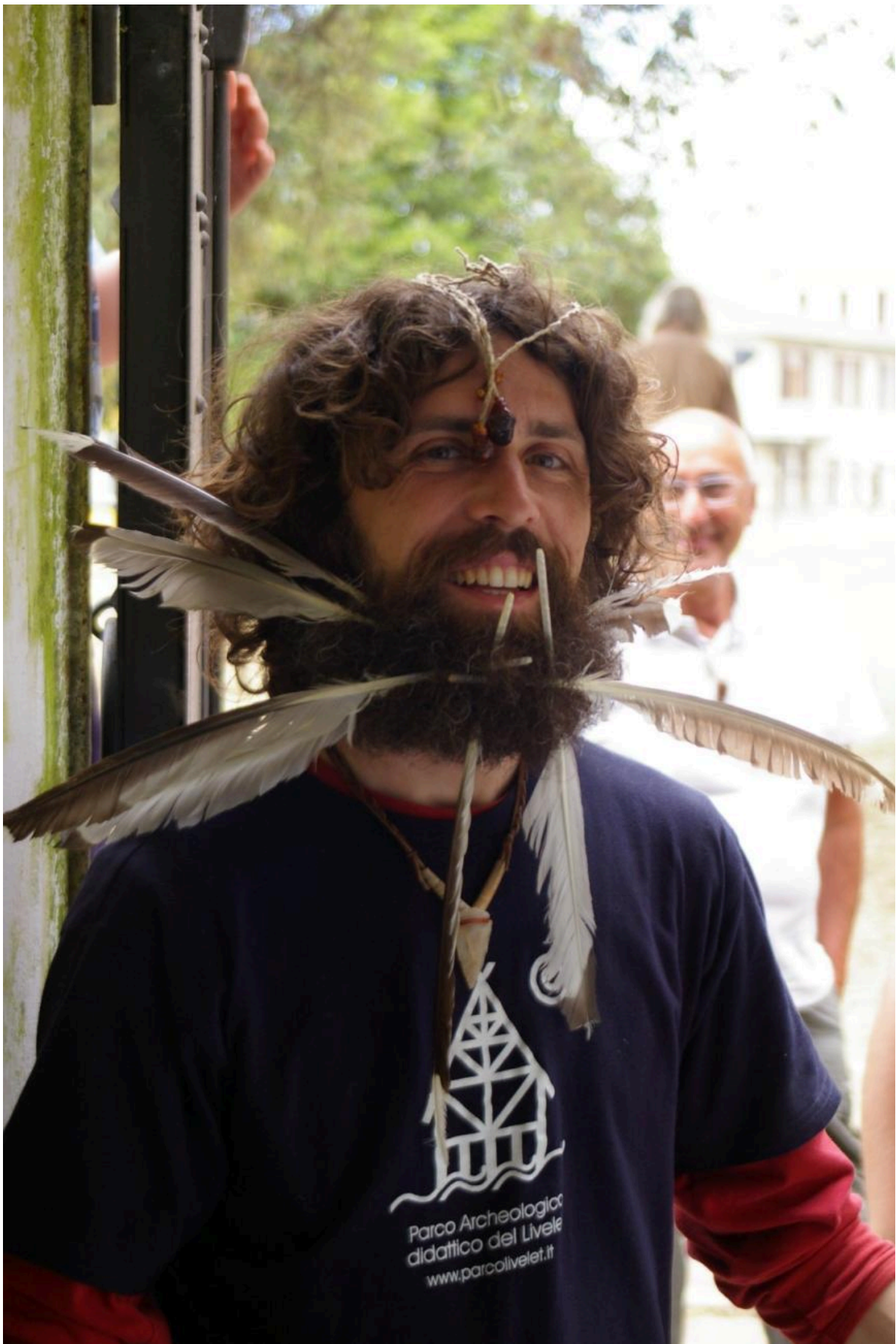
FIG 21. HAPPY OPERATOR AFTER WORK