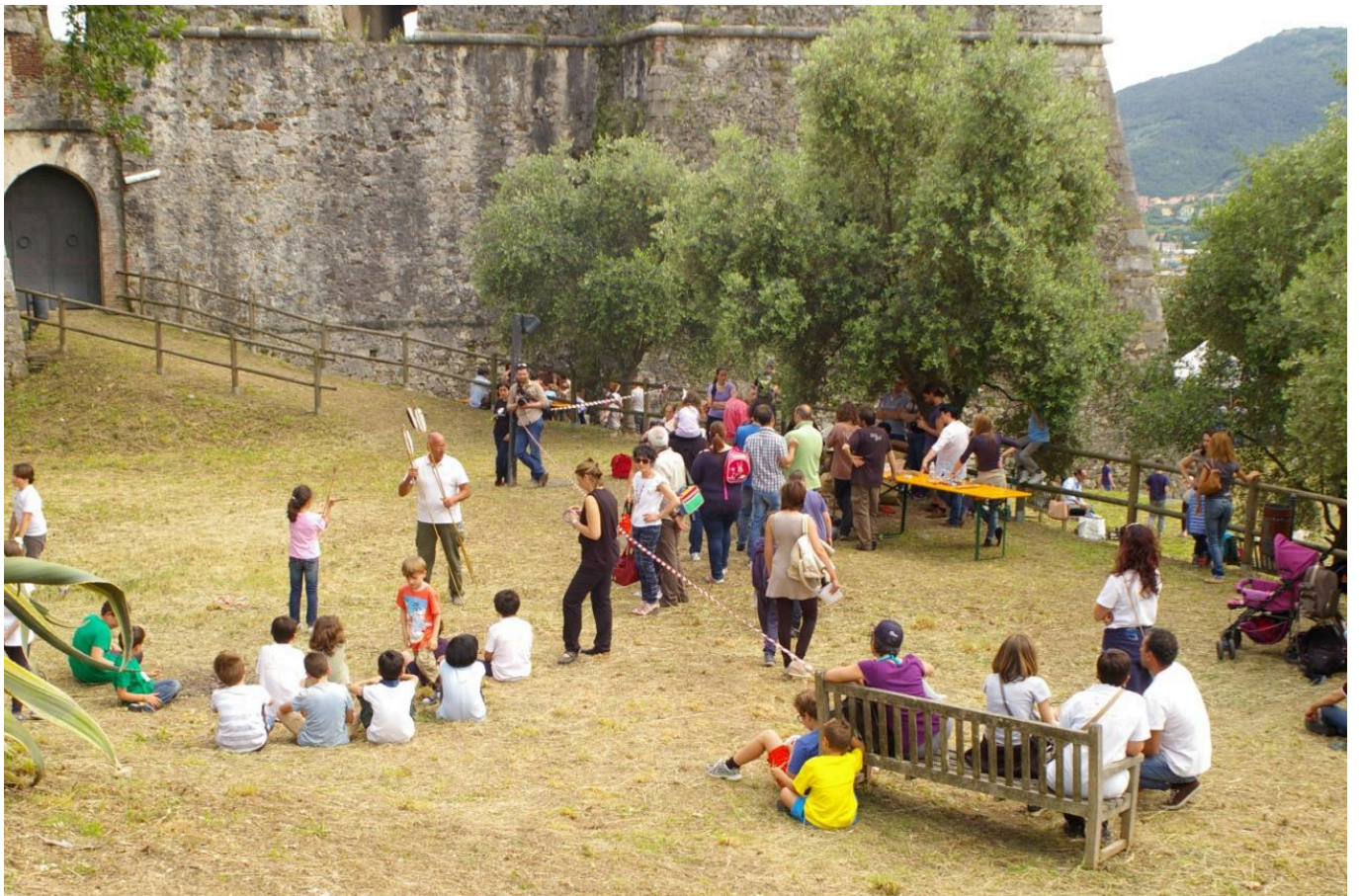
FIG 10. VISITORS IN THE PARK