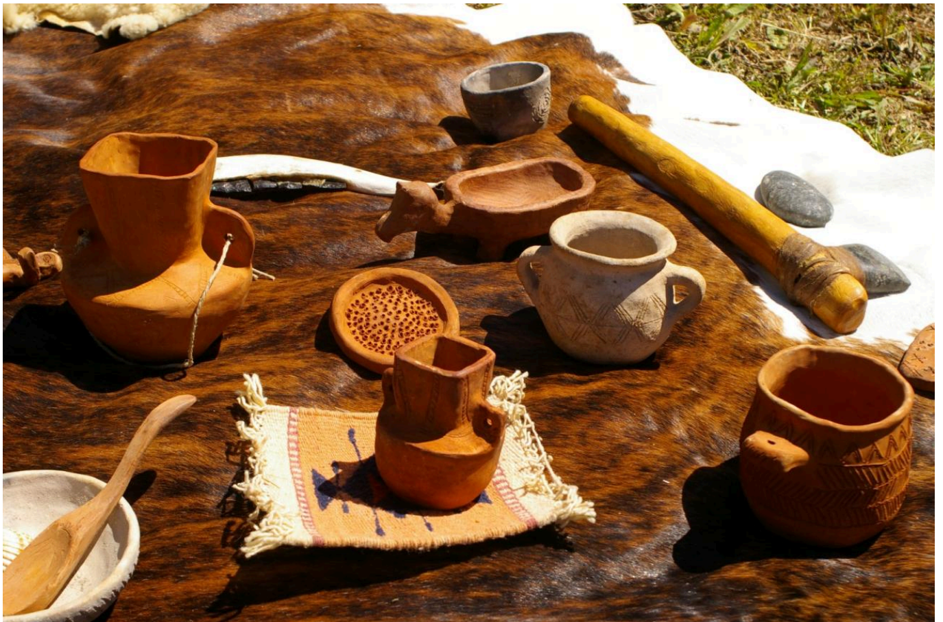
FIG 3. NEOLITHIC POTTERY WORKSHOP