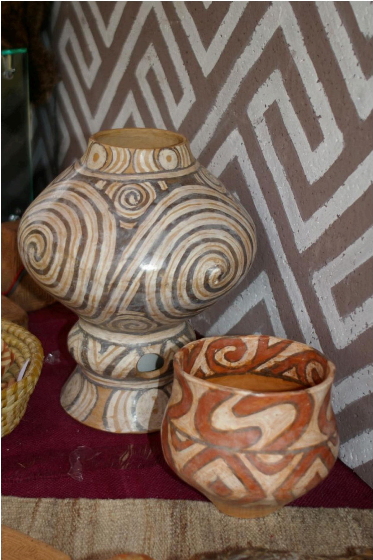
FIG 16. WORKSHOP ON DECORATED POTTERY