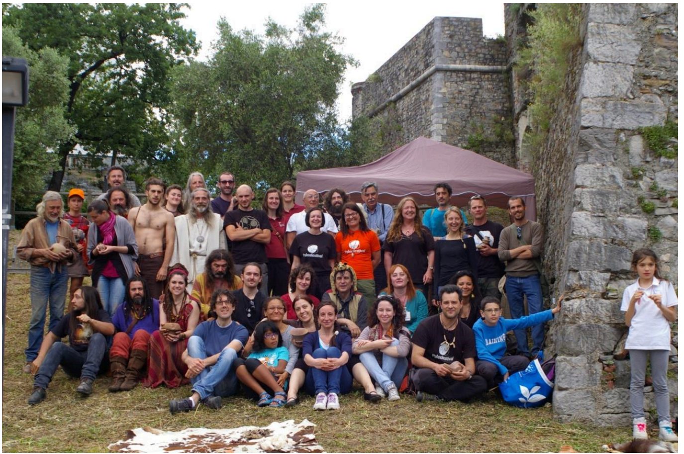
FIG 17. THE GROUP OF OPERATORS