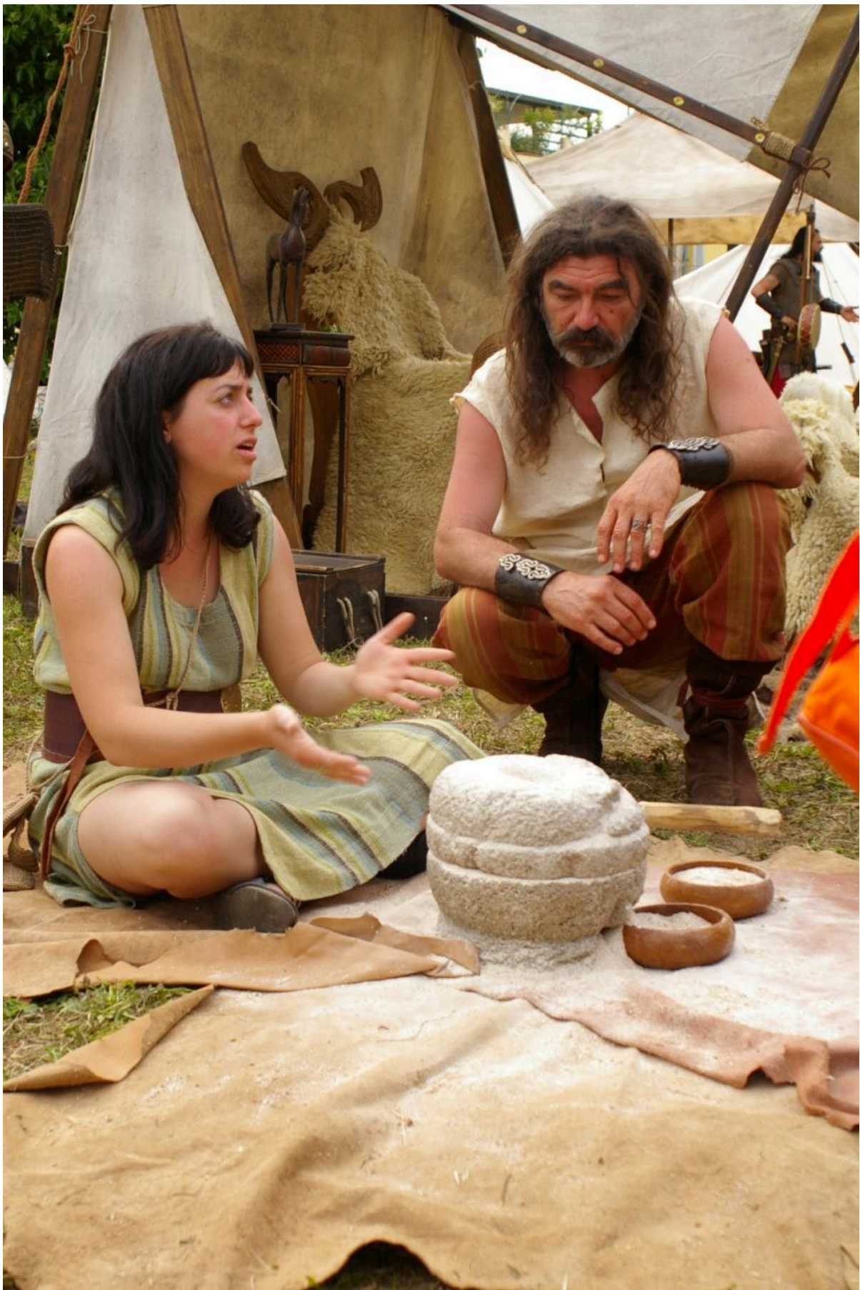
FIG 14. GRINDING CEREALS