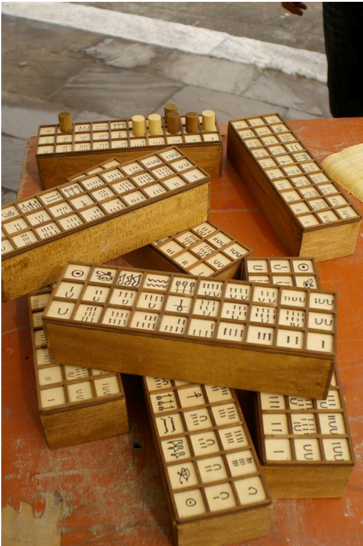
FIG 12. ANCIENT EGYPTIAN GAMES