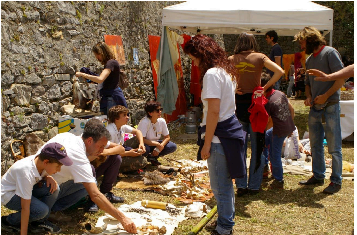
FIG 18. THE MARKET