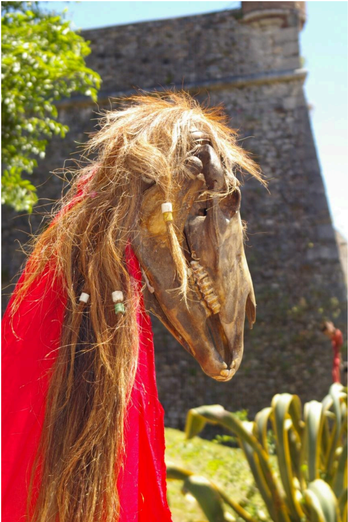
FIG 4. CELTIC HORSE GODDESS (EPONA)