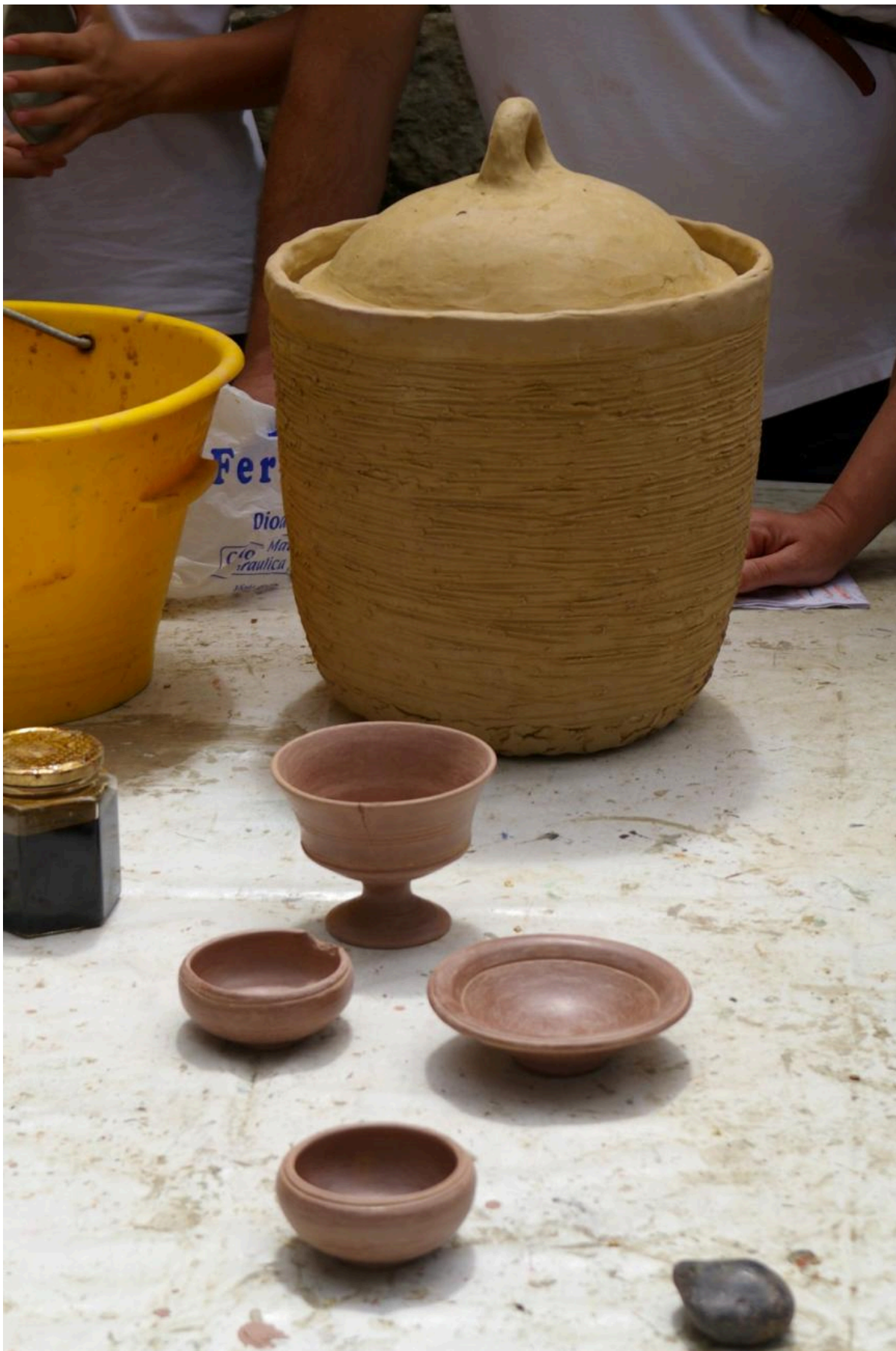
FIG 19. COOKING WITH ETRUSCANS POTS