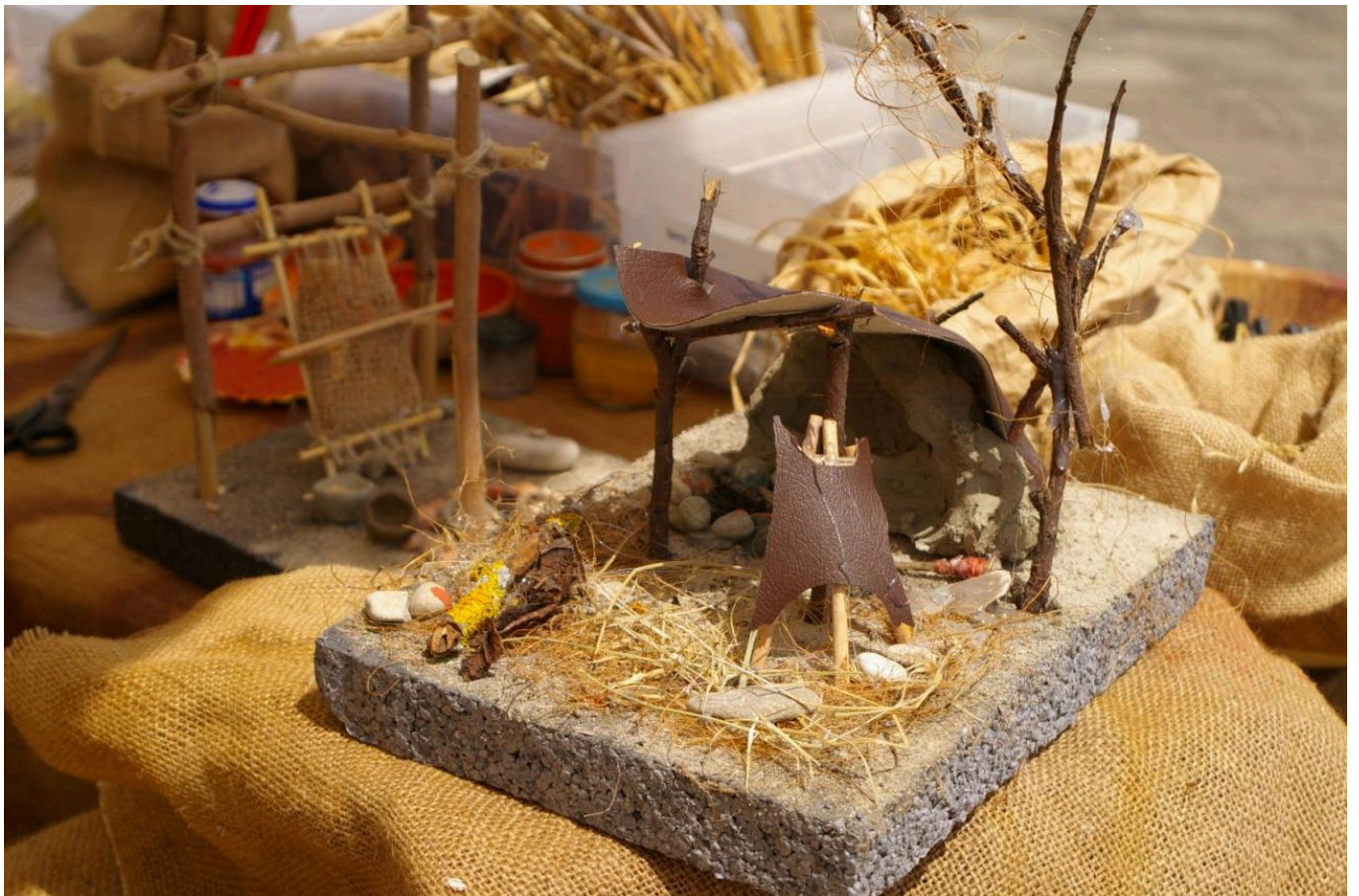
FIG 8. BUILDING A MODEL OF A PALAEOLOGIC HOUSE