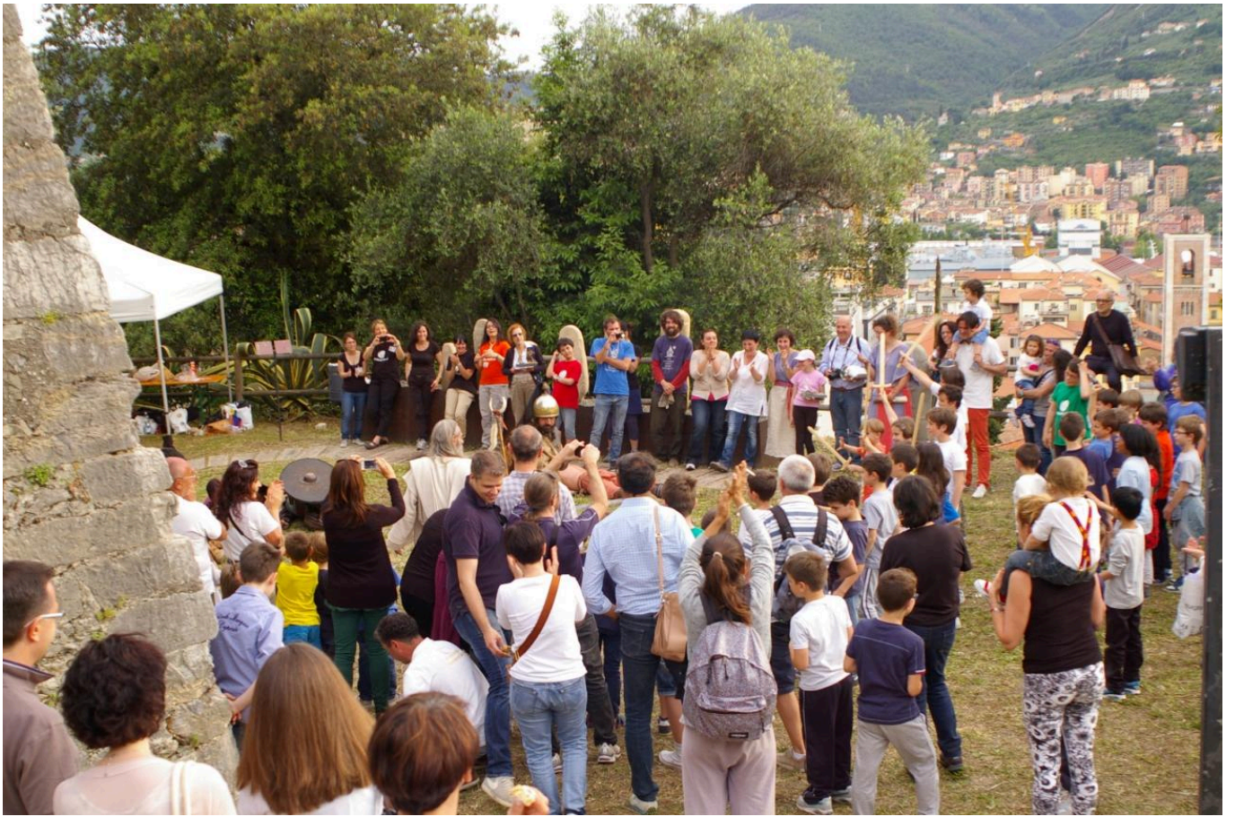
FIG 15. CLAN REUNION