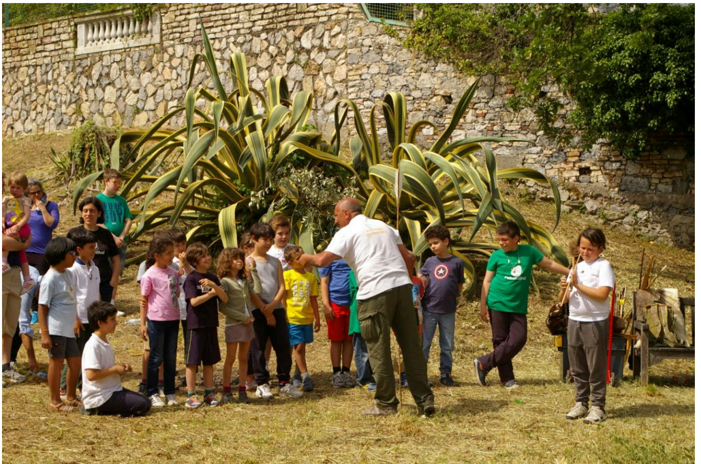
FIG 9. CHILDREN WAITING TO USE ATLATL