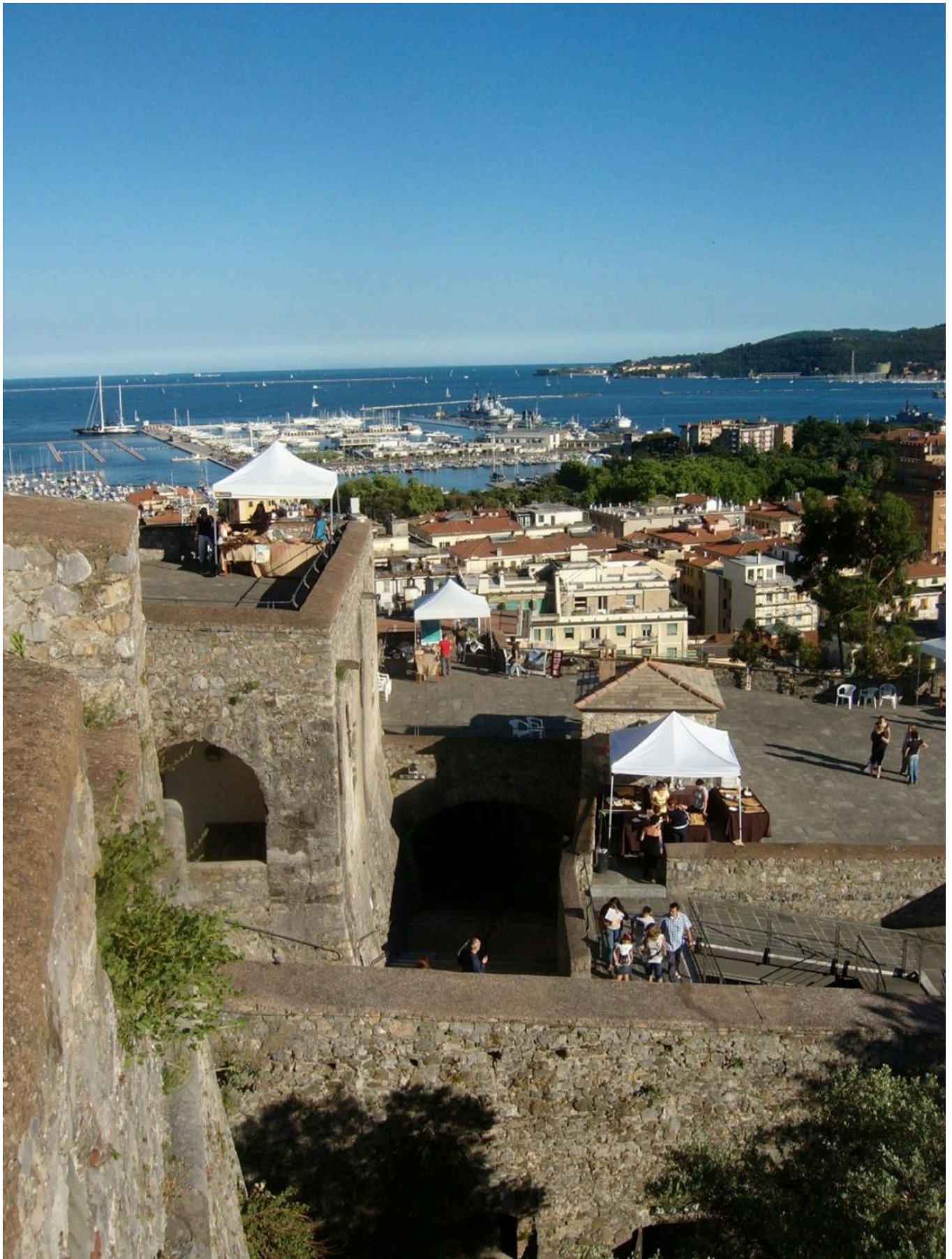
FIG 1. VIEW OF THE GULF FROM THE CASTLE