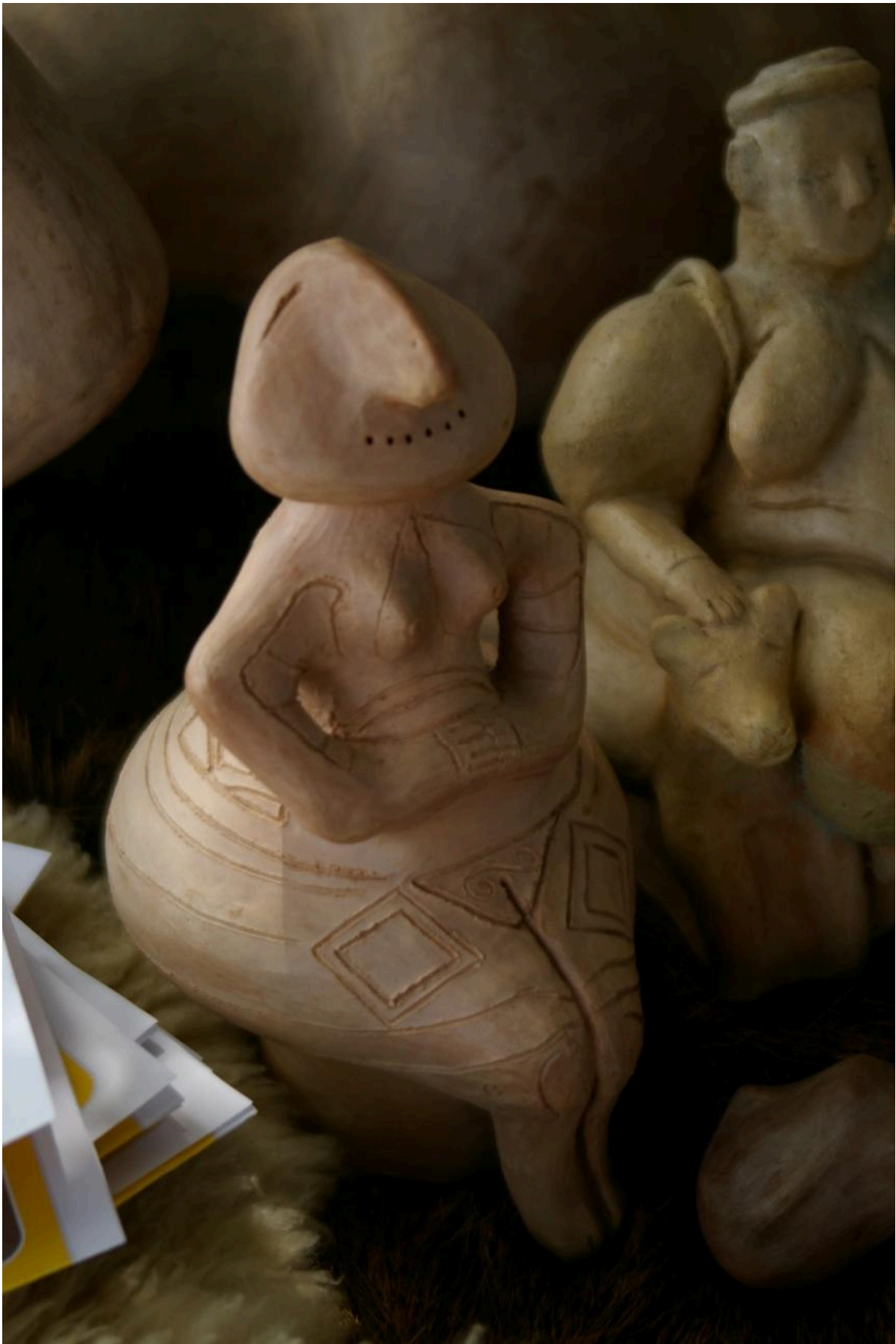
FIG 22. A NEOLITHIC IDOL