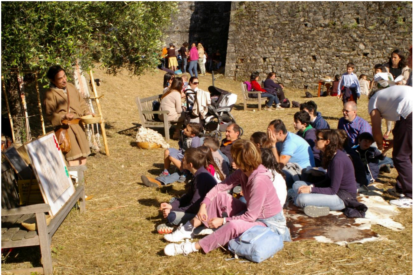
FIG 2. EXPLANATION OF THE ANCIENT GAMES