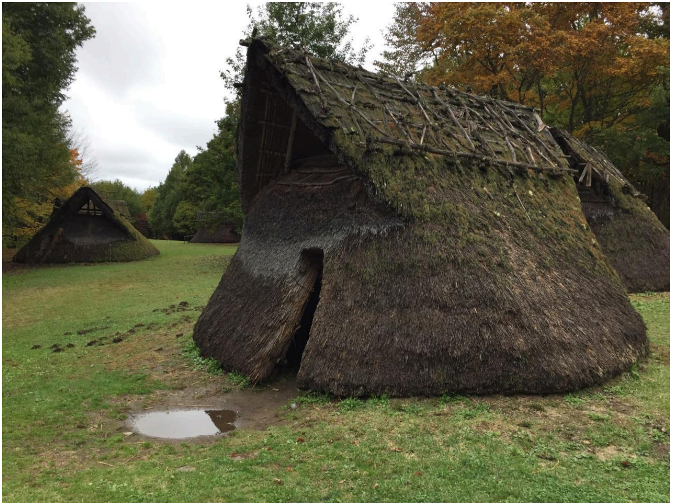
FIG 1. RECONSTRUCTED PIT HOUSES AT TOGARIISHI-YOSUKEONE SITE IN CHINO CITY, NAGANO PREFECTURE. (2 DECEMBER 2017).