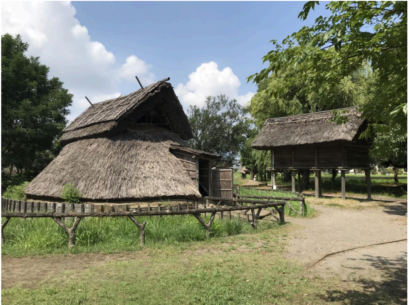
FIG 9. CURRENT PIT HOUSE AND RAISED FLOOR STOREHOUSE BASED ON SEKINO MASARU'S DESIGNS AT TORO SITE IN SHIZUOKA CITY, SHIZUOKA PREFECTURE. (23 AUGUST 2020).