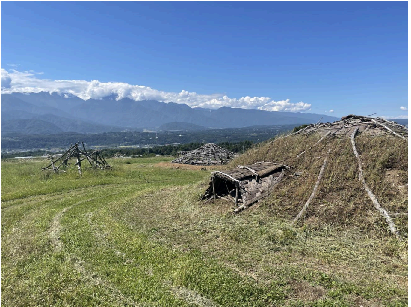
FIG 11. UMENOKI SITE HAS BEEN ENVISIONED BY SANO TAKASHI AS AN EXPERIMENTAL SITE WHERE THE RECONSTRUCTED BUILDINGS ARE IN VARYING STATES OF COMPLETENESS. (19 NOVEMBER 2020).