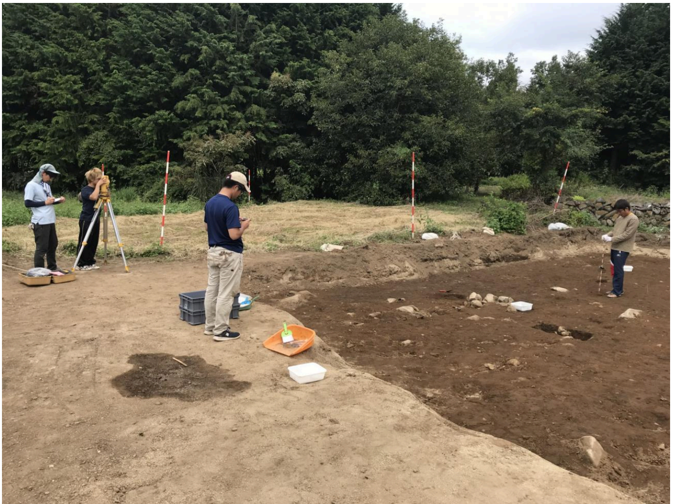
FIG 5. EXCAVATION AT SUWAHARA SITE IN HOKUTO CITY, YAMANASHI PREFECTURE. (19 SEPTEMBER 2019).