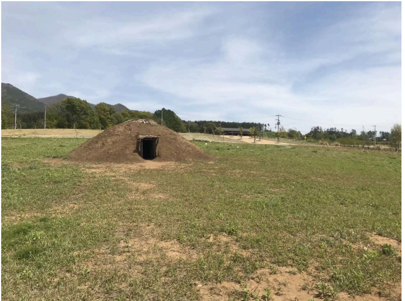
FIG 3. VIEW OF THE SOD ROOF PIT HOUSE AND SURROUNDING LANDSCAPE AT UMENOKI SITE IN HOKUTO CITY, YAMANASHI PREFECTURE. (20 SEPTEMBER 2021)