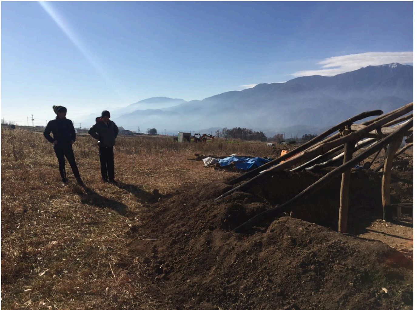
FIG 10. SANO TAKASHI (RIGHT) TALKING WITH YOSHIDA YASUYUKI (LEFT) DURING THE AUTHORS' FIRST VISIT TO UMENOKI SITE SOON AFTER ITS PUBLIC OPENING. (3 DECEMBER 2017).