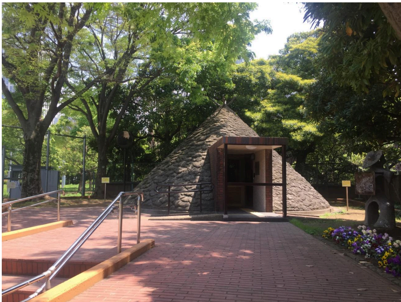
FIG 7. CONCRETE PIT HOUSE BASED ON REMAINS OF ISARAGO SITE IN MINATO CITY, TOKYO. IT IS LOCATED AT MITADAI PARK, ADJACENT TO THE ISARAGO SITE, WHICH WAS FULLY EXCAVATED AND TURNED INTO AN OFFICE BUILDING. (29 APRIL 2017).