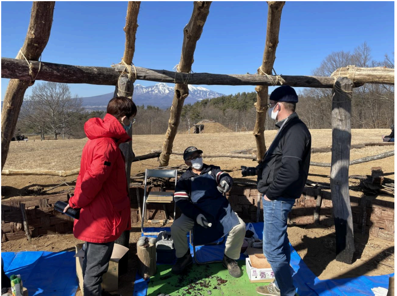
FIG 13. EXPERIMENTAL OBSIDIAN KNAPPING TAUGHT TO STAFF AND VOLUNTEERS AT UMENOKI SITE. THE COURSE WAS HELD IN ONE OF THE PIT HOUSES CURRENTLY UNDER CONSTRUCTION. AMONG THE PARTICIPANTS INCLUDED A LOCAL RESIDENT WHO IS ORIGINALLY FROM CANADA (RIGHT) WHO IS ENGAGED IN TOURISM PROMOTION IN YAMANASHI PREFECTURE. (6 FEBRUARY 2021).