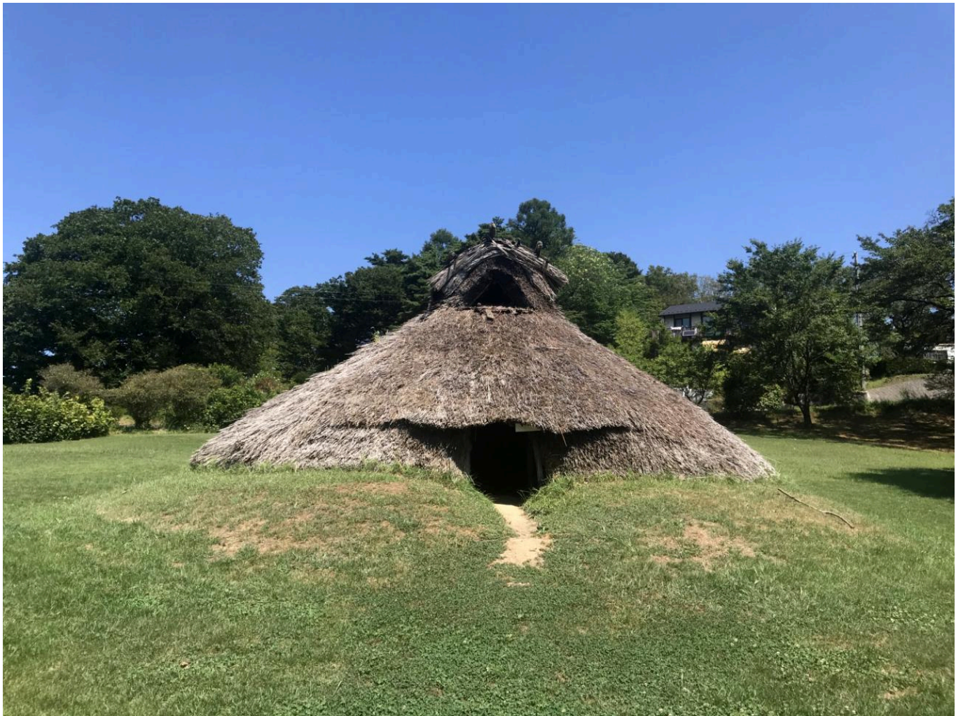
FIG 2. RECONSTRUCTED PIT HOUSE AT IDOJIRI SITE IN FUJIMI TOWN, NAGANO PREFECTURE. (6 AUGUST 2020).