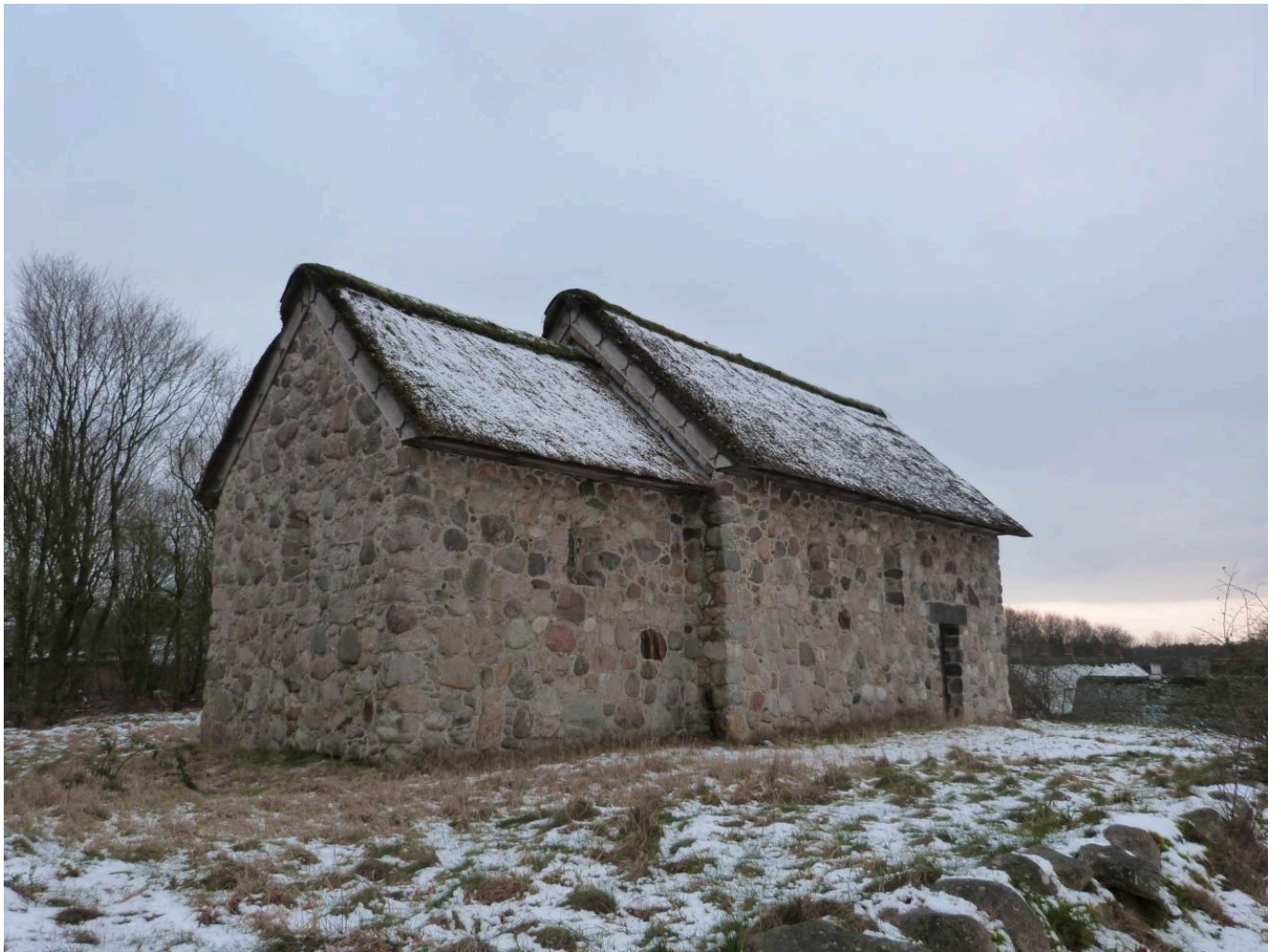
FIG 8. RECONSTRUCTED STONE CHURCH AT HJERL HEDE.