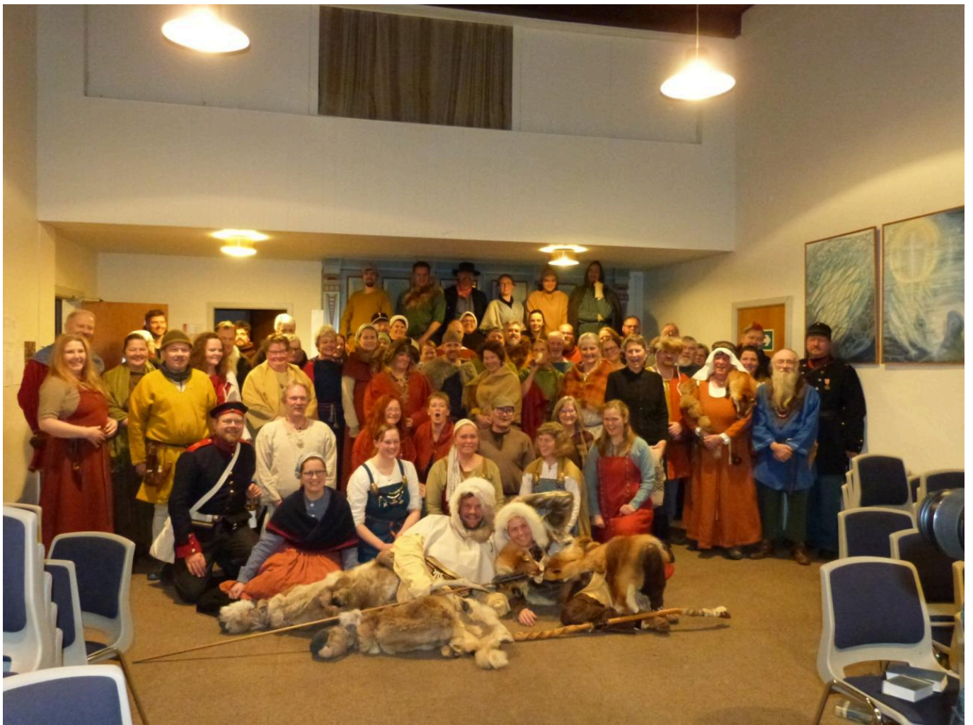
FIG 3. GROUP PICTURE OF THE WORKSHOP'S CONVENTION.