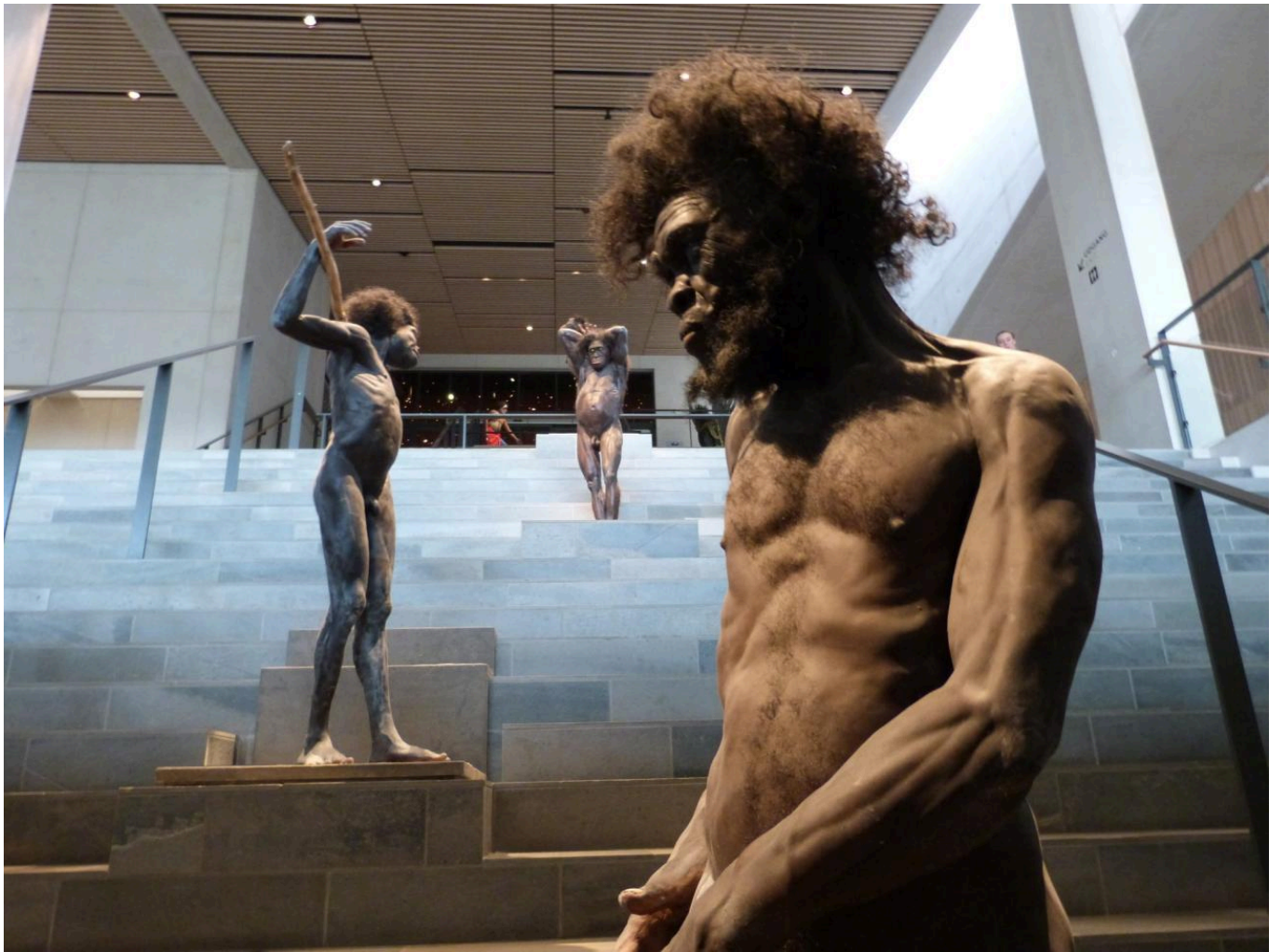
FIG 9. HOMINID FIGURES IN MOMU, MOESGAARD MUSEUM.