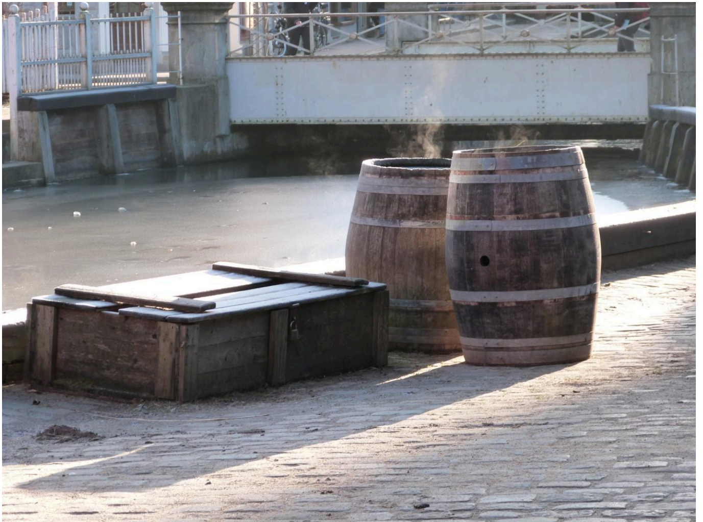
FIG 5. WINTER MORNING IN DEN GAMLE BY.