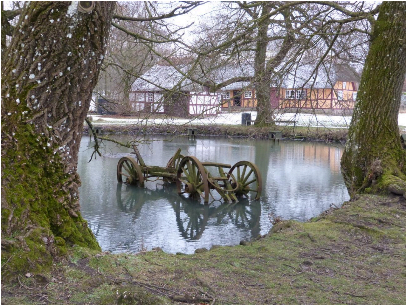
FIG 7. HJERL HEDE IN WINTER.