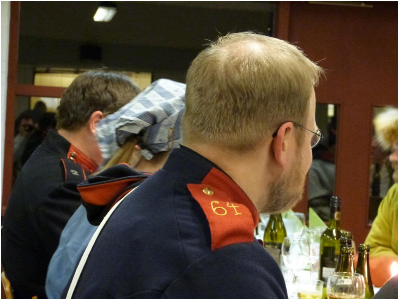
FIG 4. IN COSTUME...