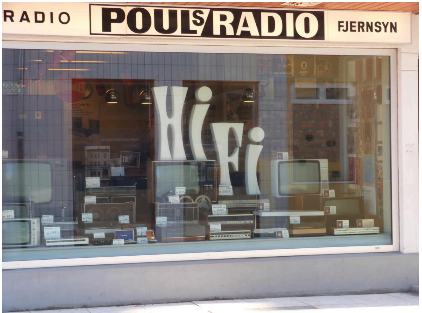
FIG 6. BACK TO THE OLD TIMES, DEN GAMLE BY. COPYRIGHT: ROELAND PAARDEKOOPEER