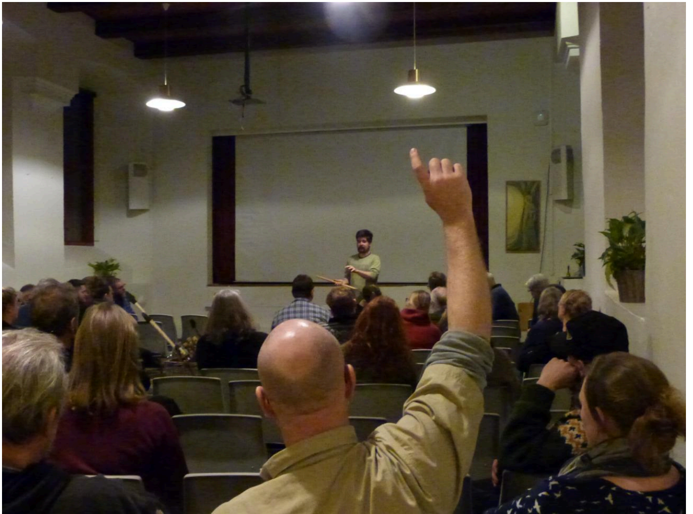
FIG 2. QUESTION TIME AT THE WORKSHOP'S EVENING.