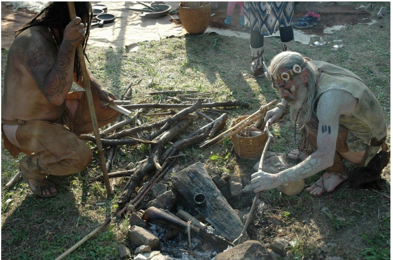
FIG 14. THE CARDIUM LIVING HISTORY GROUP.