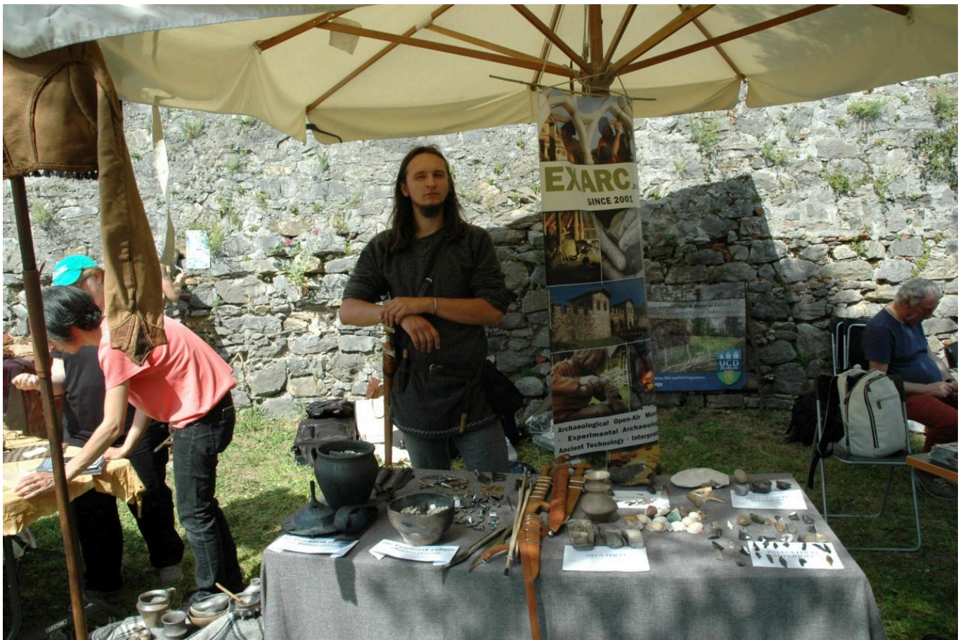
FIG 9. TABLE PRESENTATION BY THE UNIVERSITY OF LODZ (PL).