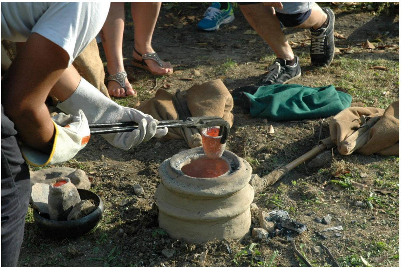
FIG 13. CASTING BRONZE.