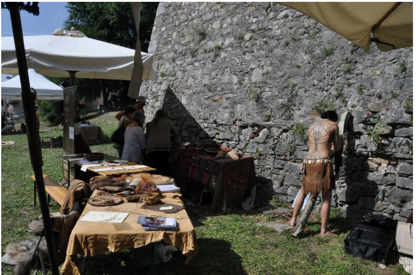
FIG 5. TABLE PRESENTATION BY THE UNIVERSITY OF EXETER.