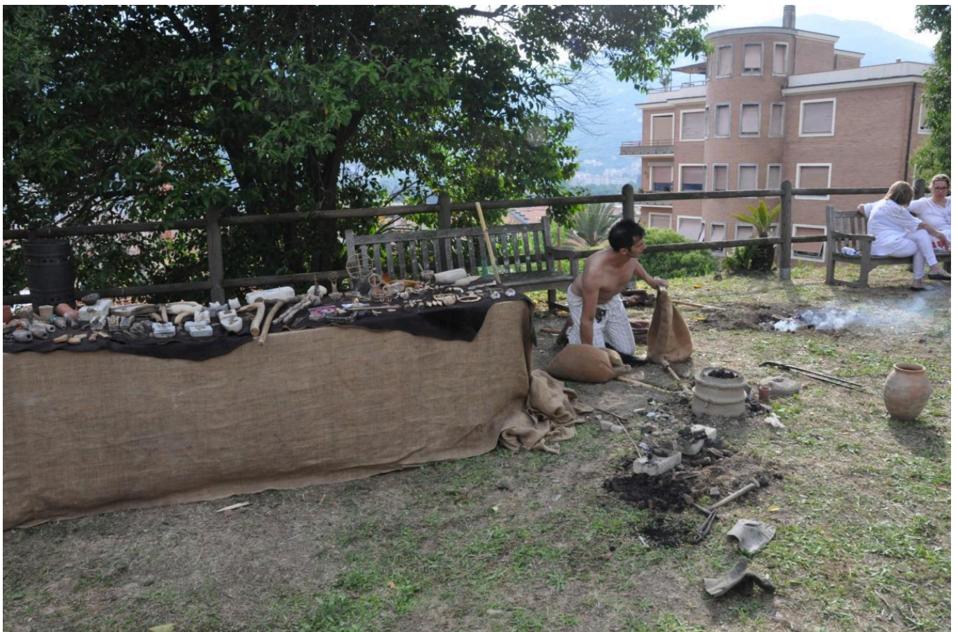
FIG 2. BRONZE CASTING AND PRESENTATION.