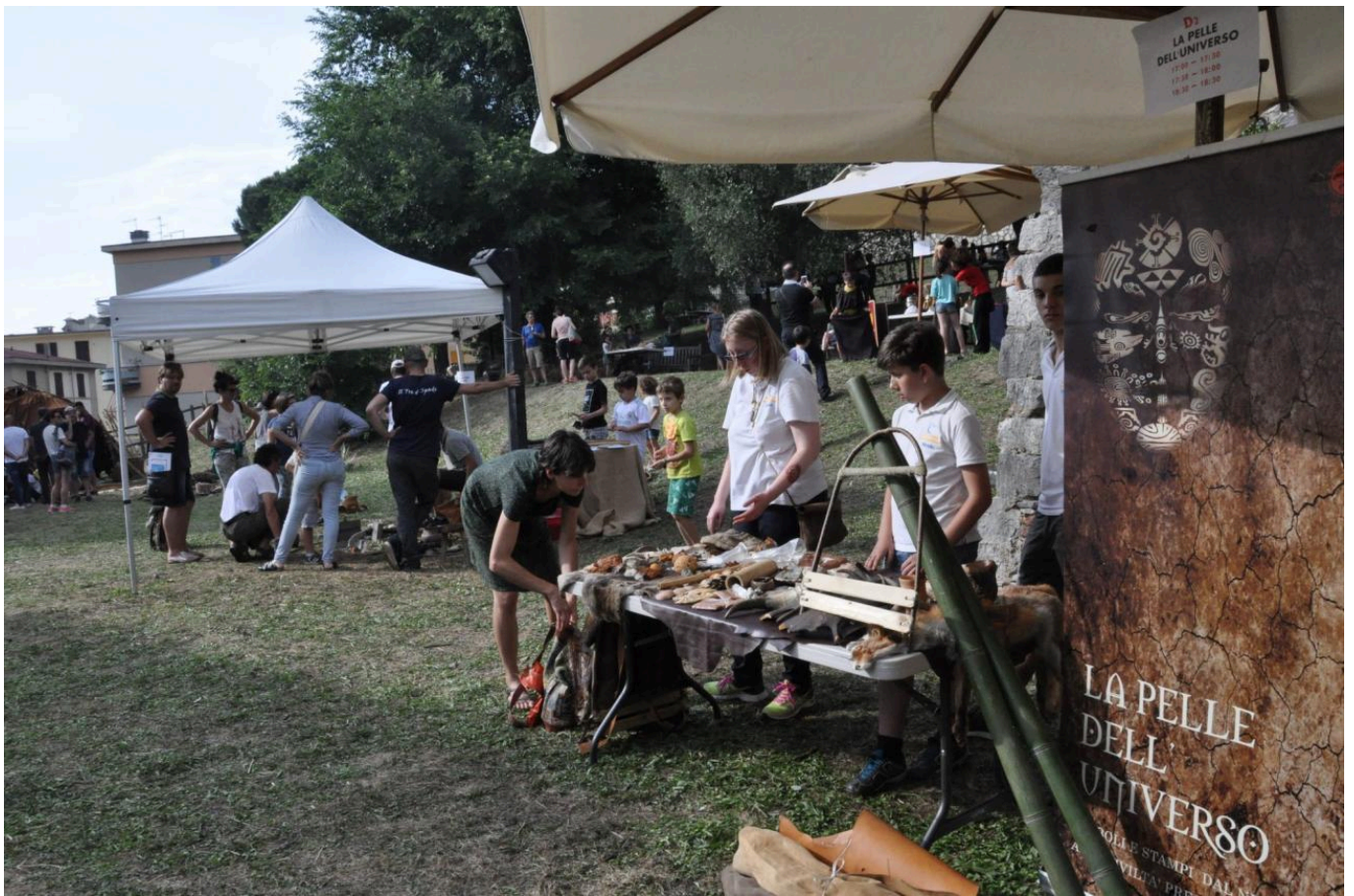
FIG 1. VIEW OF THE FESTIVAL.