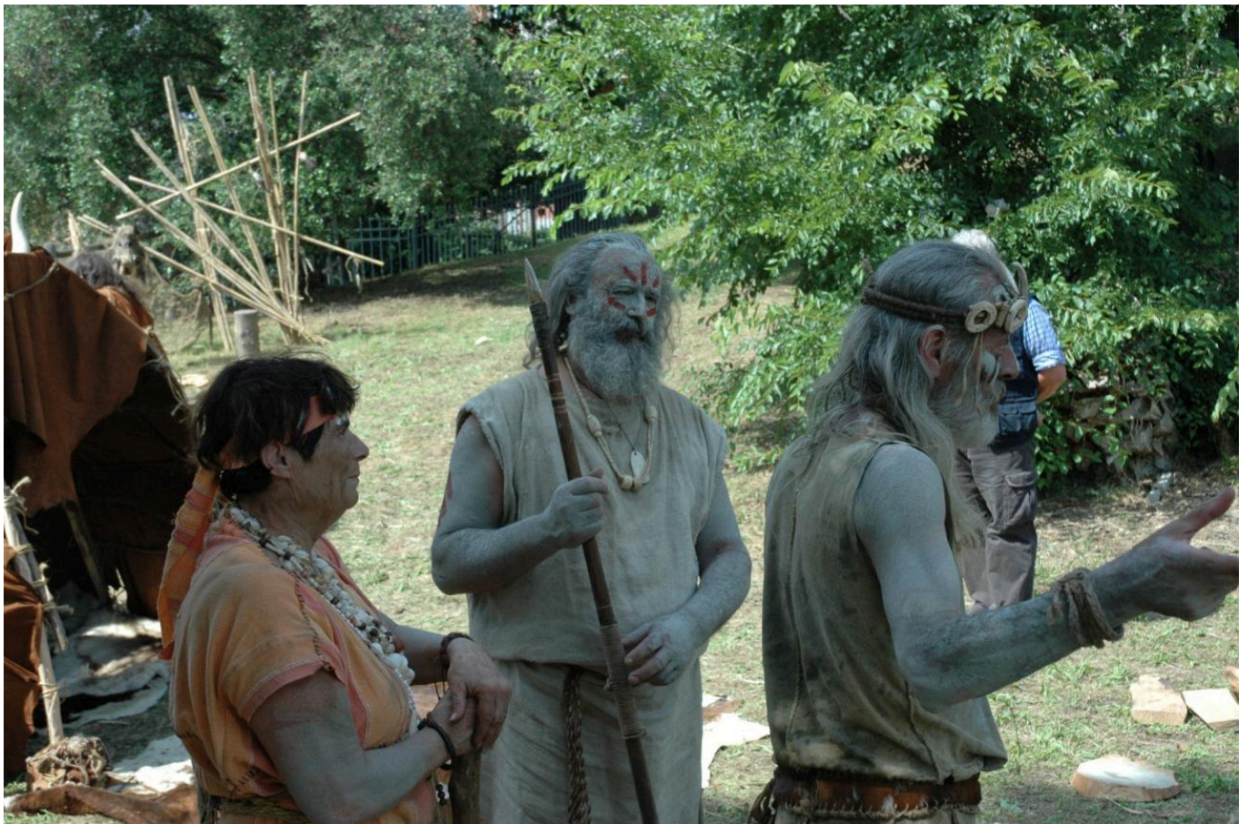
FIG 8. STONE AGE LIVING HISTORY GROUP CARDIUM.