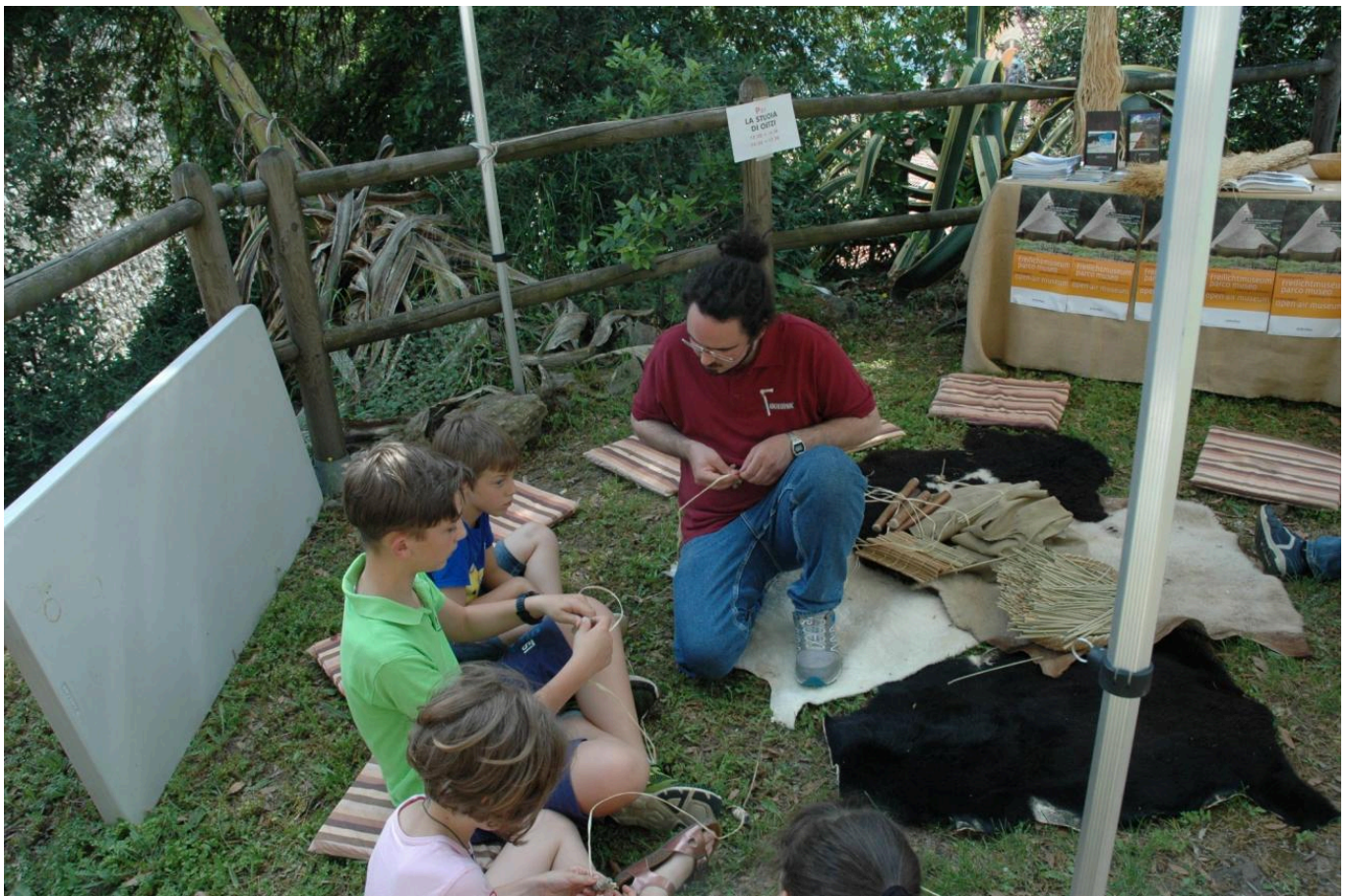
FIG 7. WORKSHOP FOR CHILDREN, ARCHEOPARC VAL SENALES.