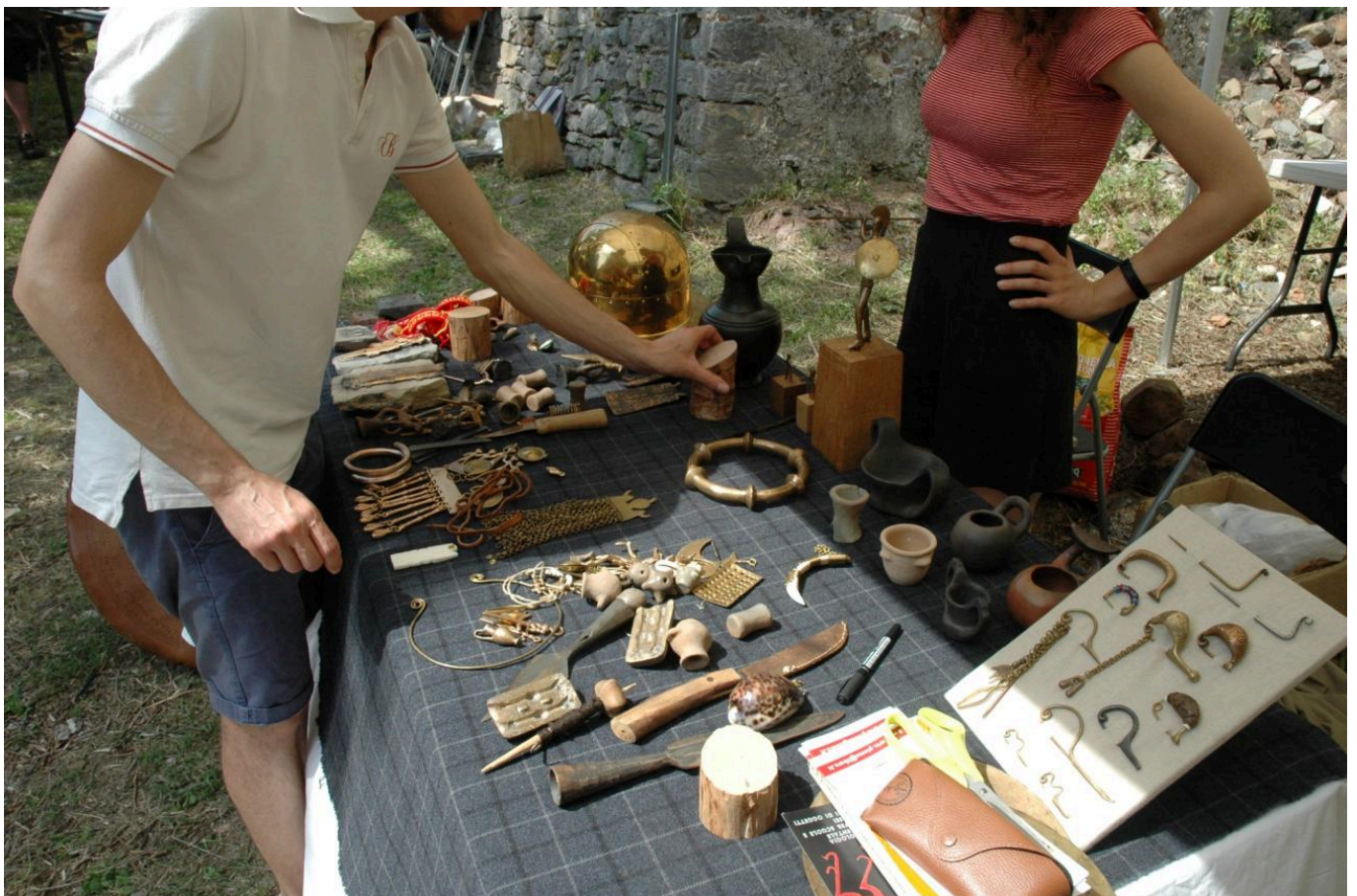
FIG 6. BRONZE REPLICA JEWELRY.