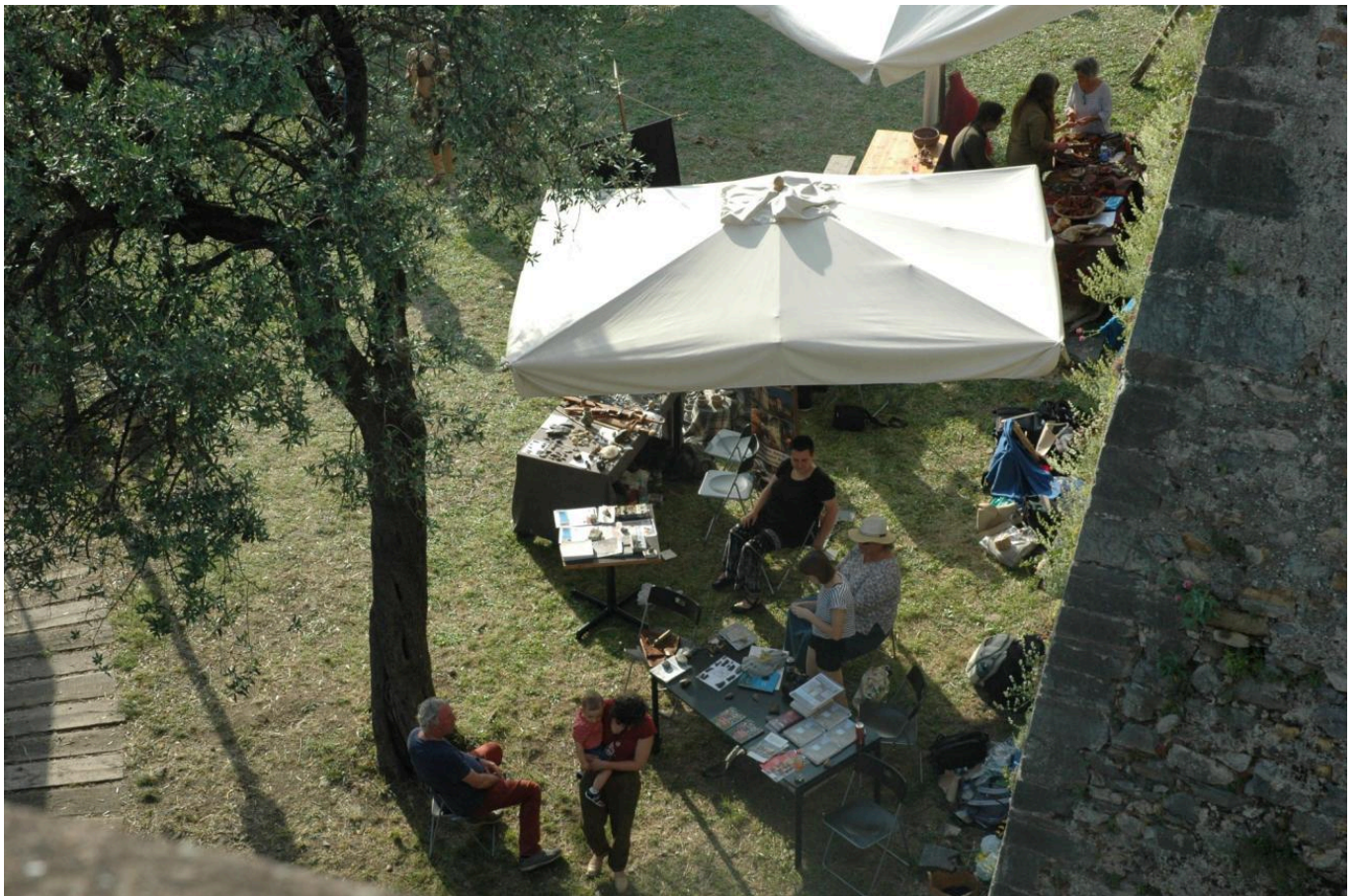
FIG 12. VIEW DOWN FROM THE CASTLE.