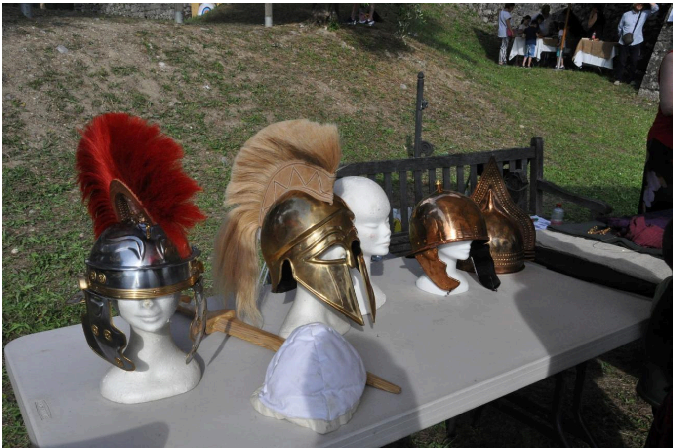
FIG 3. DIFFERENT HELMETS TO TRY OUT.