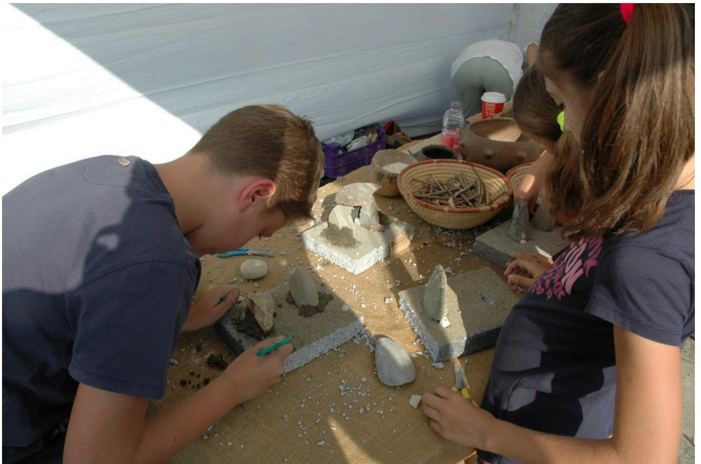
FIG 11. MAKING MINI-MEGALITHS.