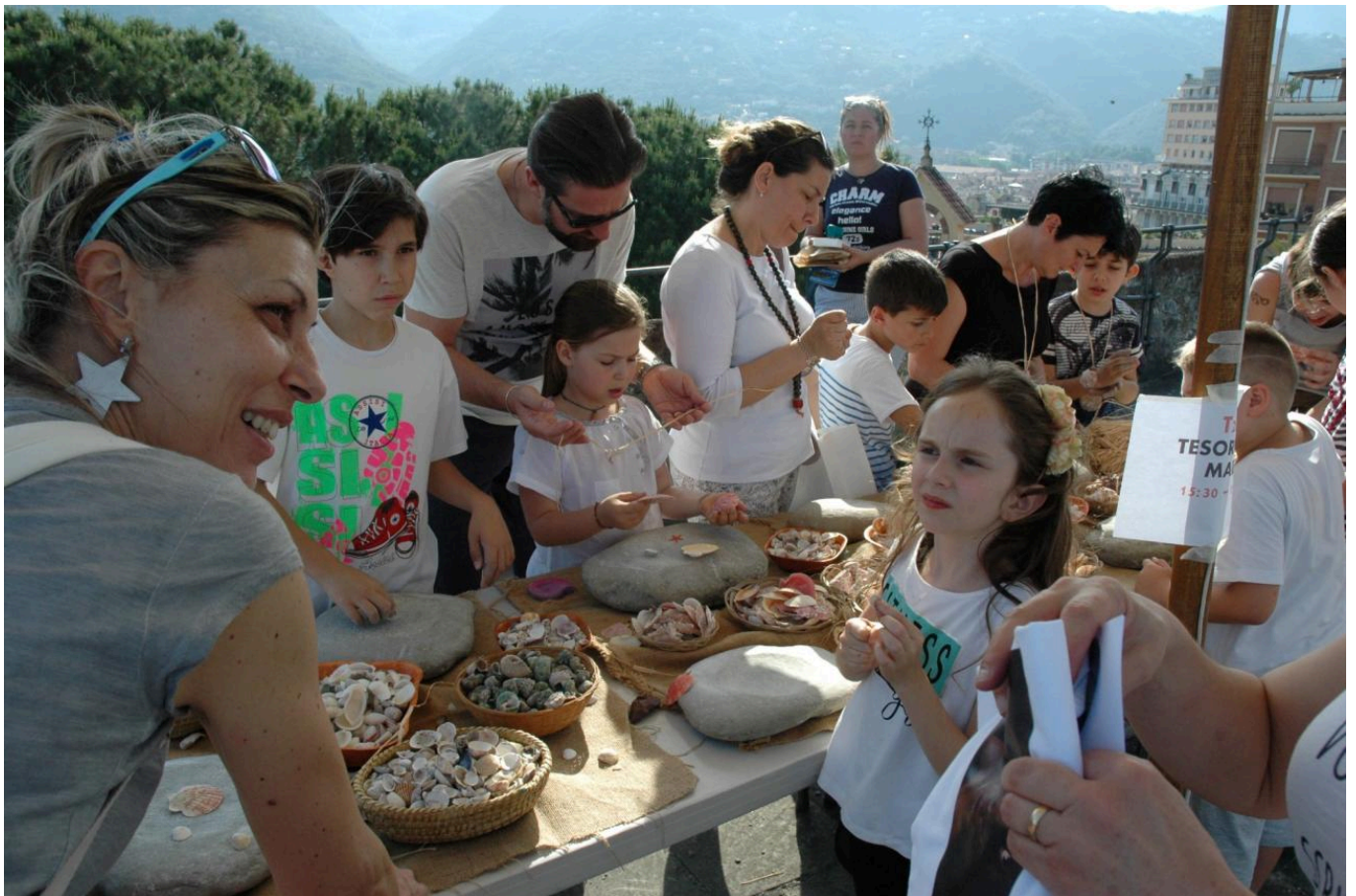
FIG 10. WORKSHOP FOR CHILDREN WITH SHELLS.