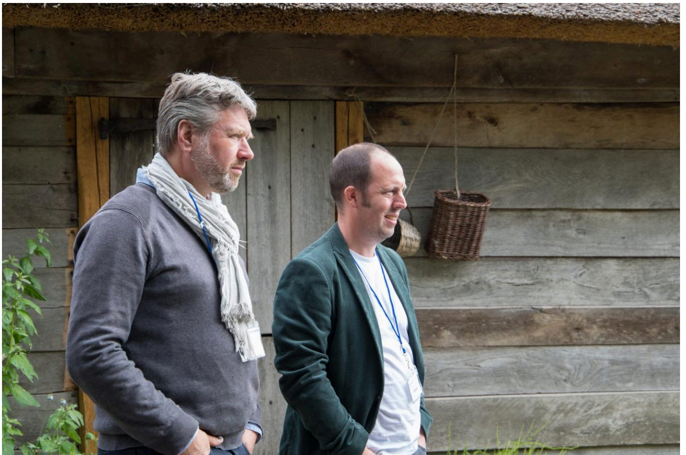
FIG 6. VOLUNTEERS FROM ZUTPHEN AT THE ARCHEON MEETING.