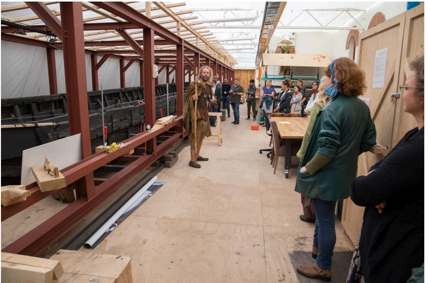
FIG 3. VISITING THE ROMAN SHIP RESTORATION WORKSHOP.