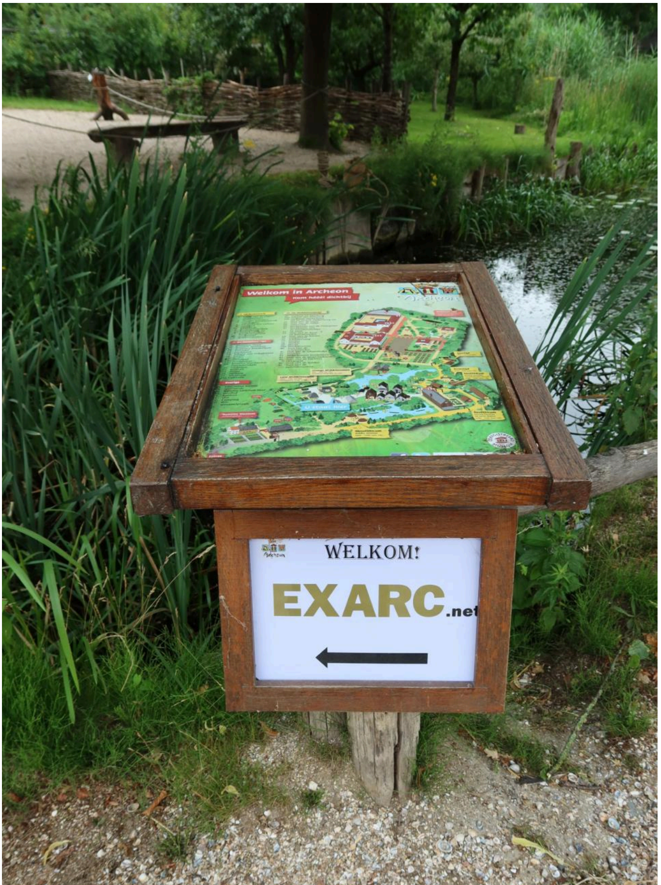
FIG 1. SIGNS, SHOWING THE WAY IN ARCHEON TOWARDS THE EXARC VENUE