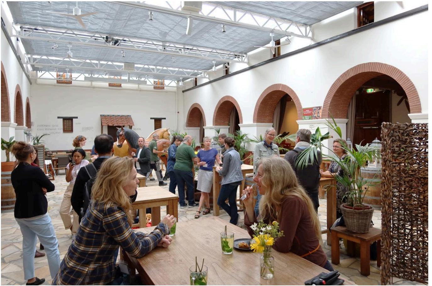
FIG 2. STARTING THE DAY WITH AN INFORMAL GET TOGETHER.