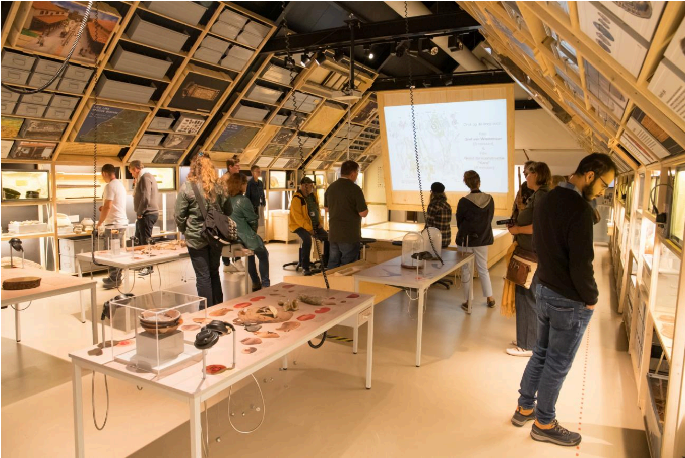
FIG 8. THE INDOOR EXHIBITION IN ARCHEON.