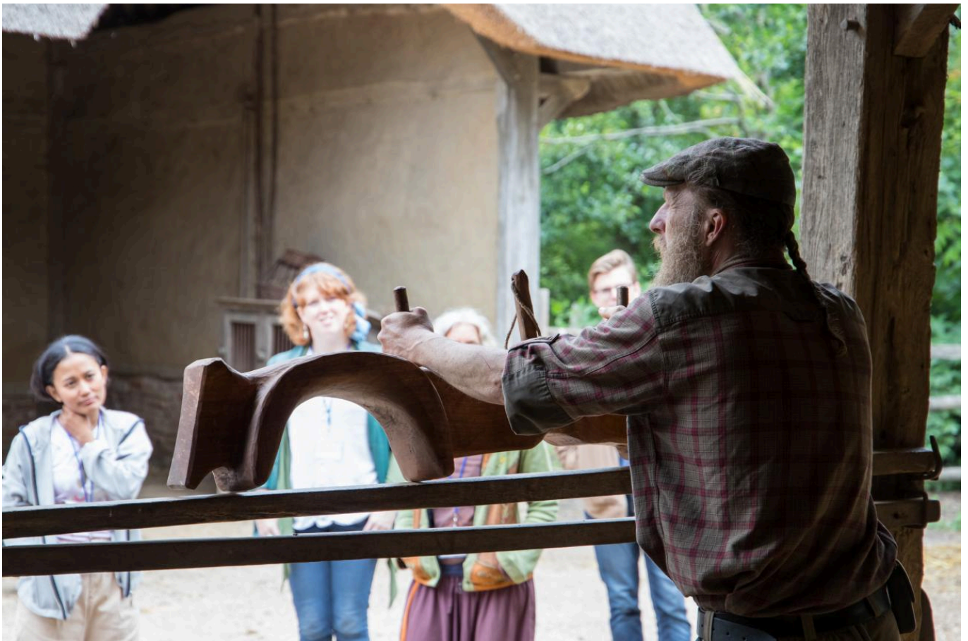
FIG 5. THE OXEN YOKE, SHOWN TO THE VOLUNTEERS.