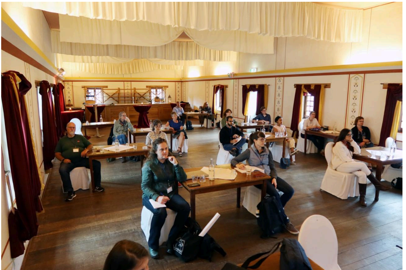
FIG 10. DURING THE WORKSHOPS, WITH APPROPRIATE DISTANCING.