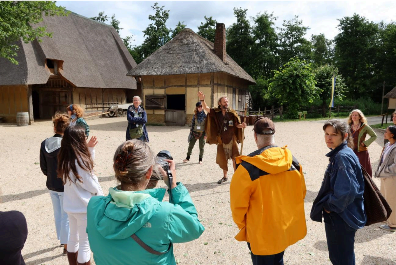
FIG 9. A VIEW ON THE MIDDLE AGES IN ARCHEON.