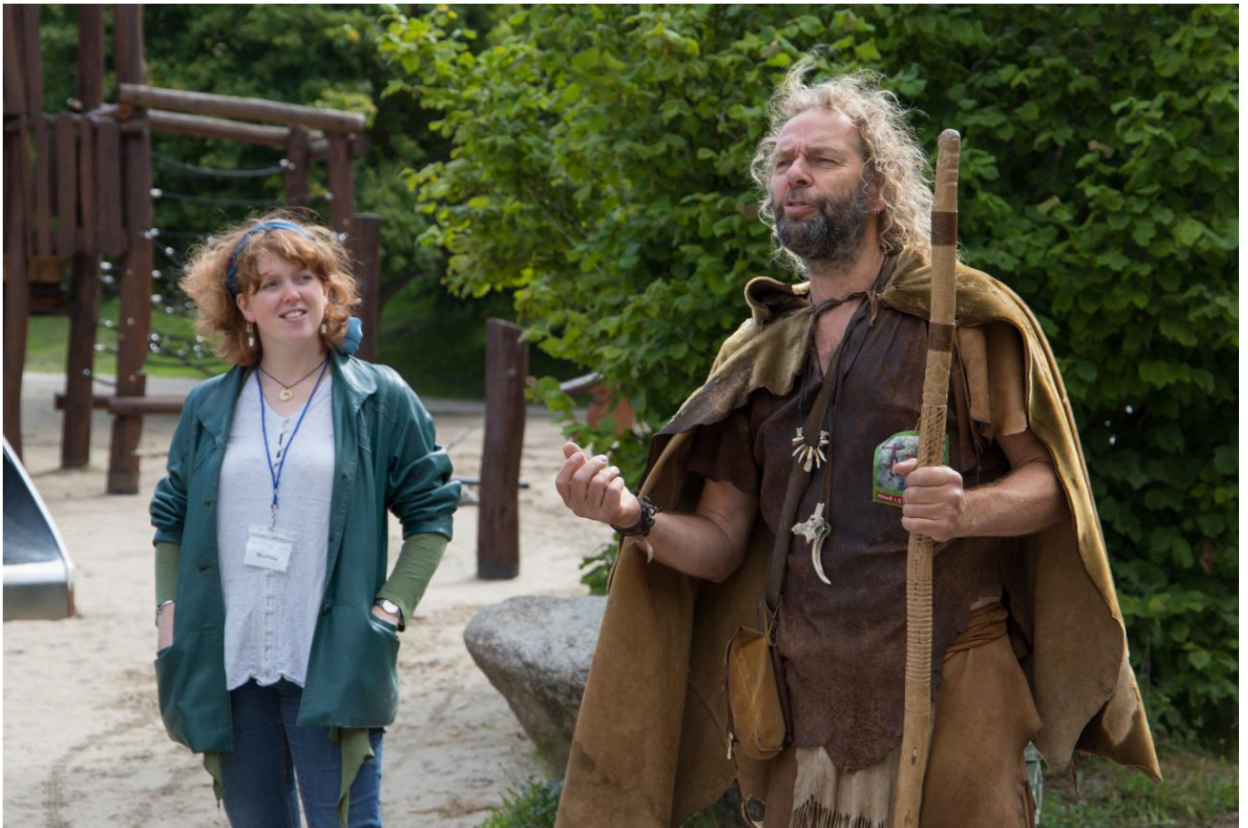
FIG 4. GUIDED TOUR THROUGH ARCHEON.