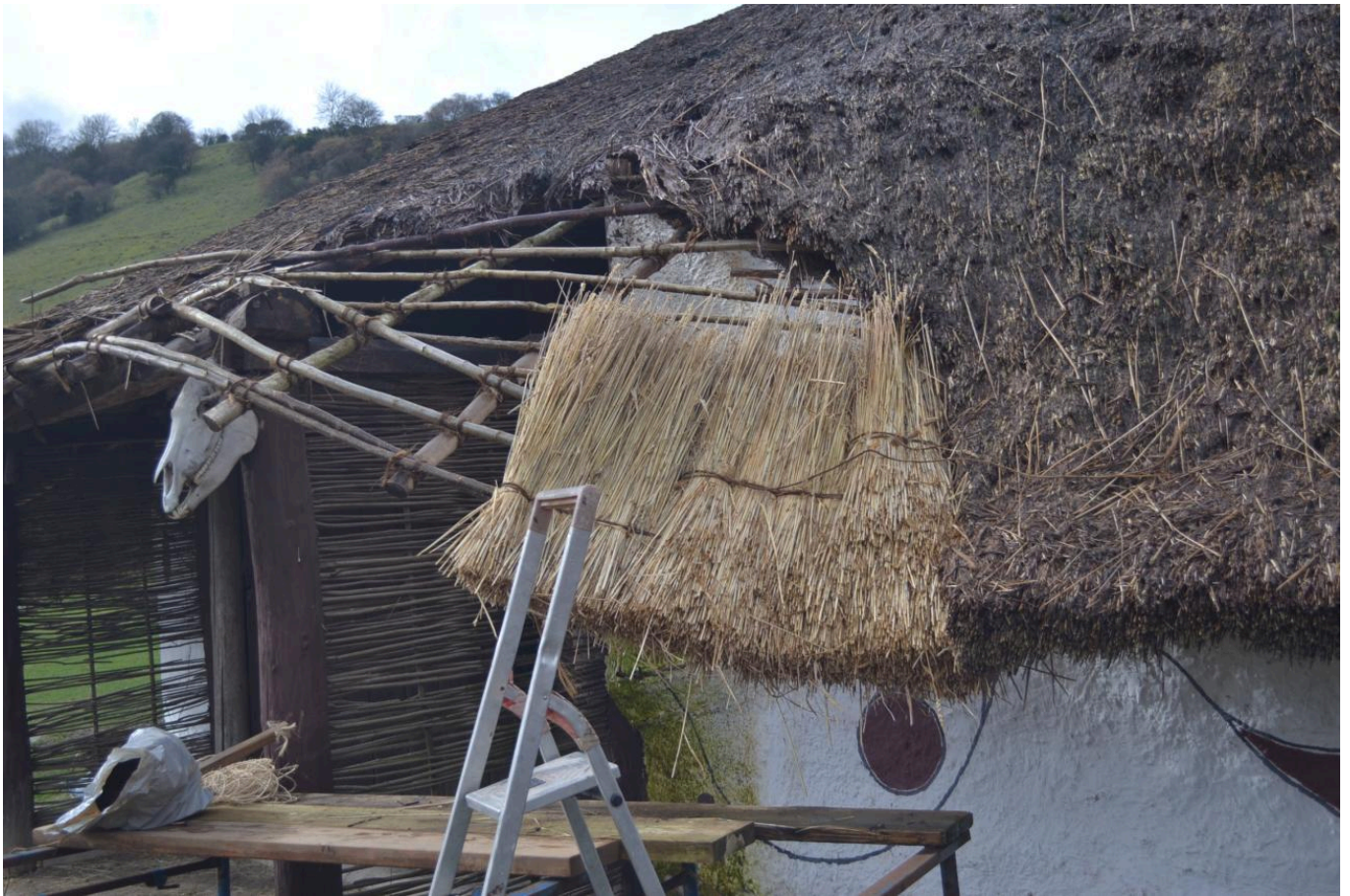
FIG 2. REPAIRING A ROOF. COPYRIGHT: G.D. FREEMAN