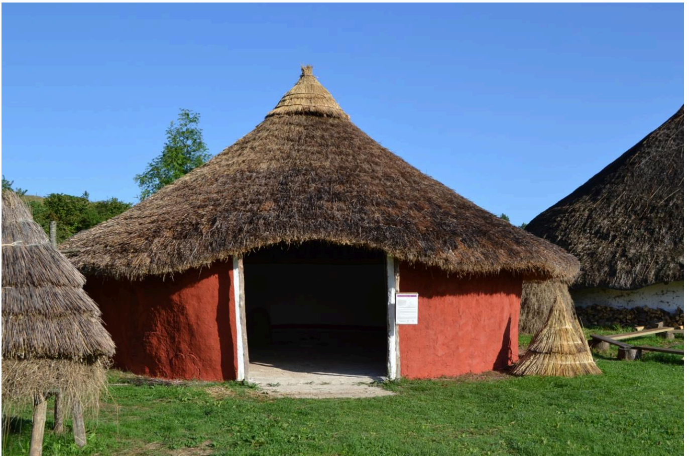
FIG 3. ROUNDHOUSE RECONSTRUCTION.