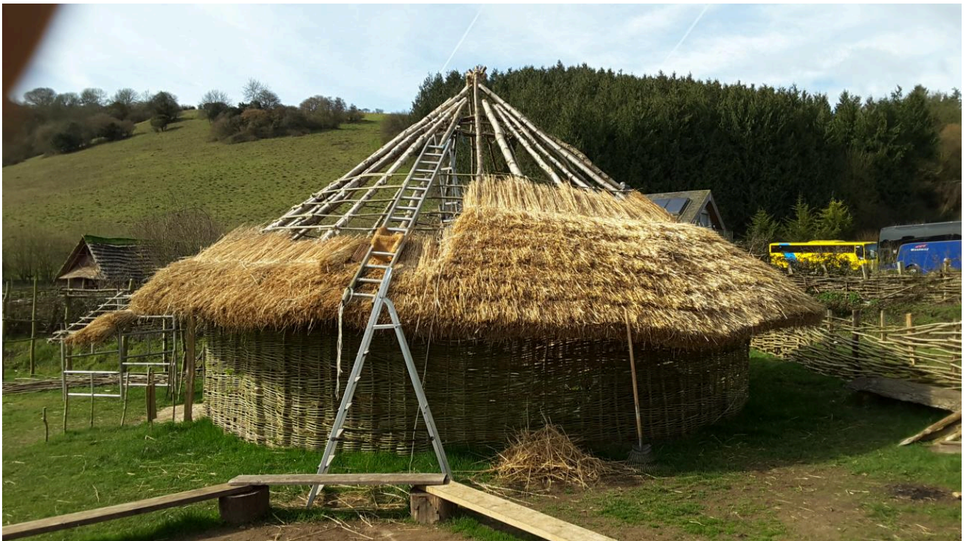
FIG 1. THATCHING UNDERWAY